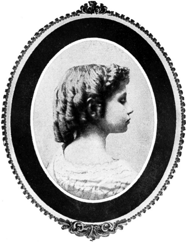
HELEN KELLER AT THE AGE OF SEVEN

tried to imitate it. When I finally succeeded in making the letters correctly I was flushed with childish pleasure and pride. Running downstairs to my mother I held up my hand and made the letters for doll. I did not know that I was spelling a word or even that words existed; I was simply making my fingers go in monkey-like imitation. In the days that followed I learned to spell in this uncomprehending way a great many words, among them pin , hat , cup and a few verbs like sit , stand and walk . But my teacher had been with me several weeks before I understood that everything has a name.