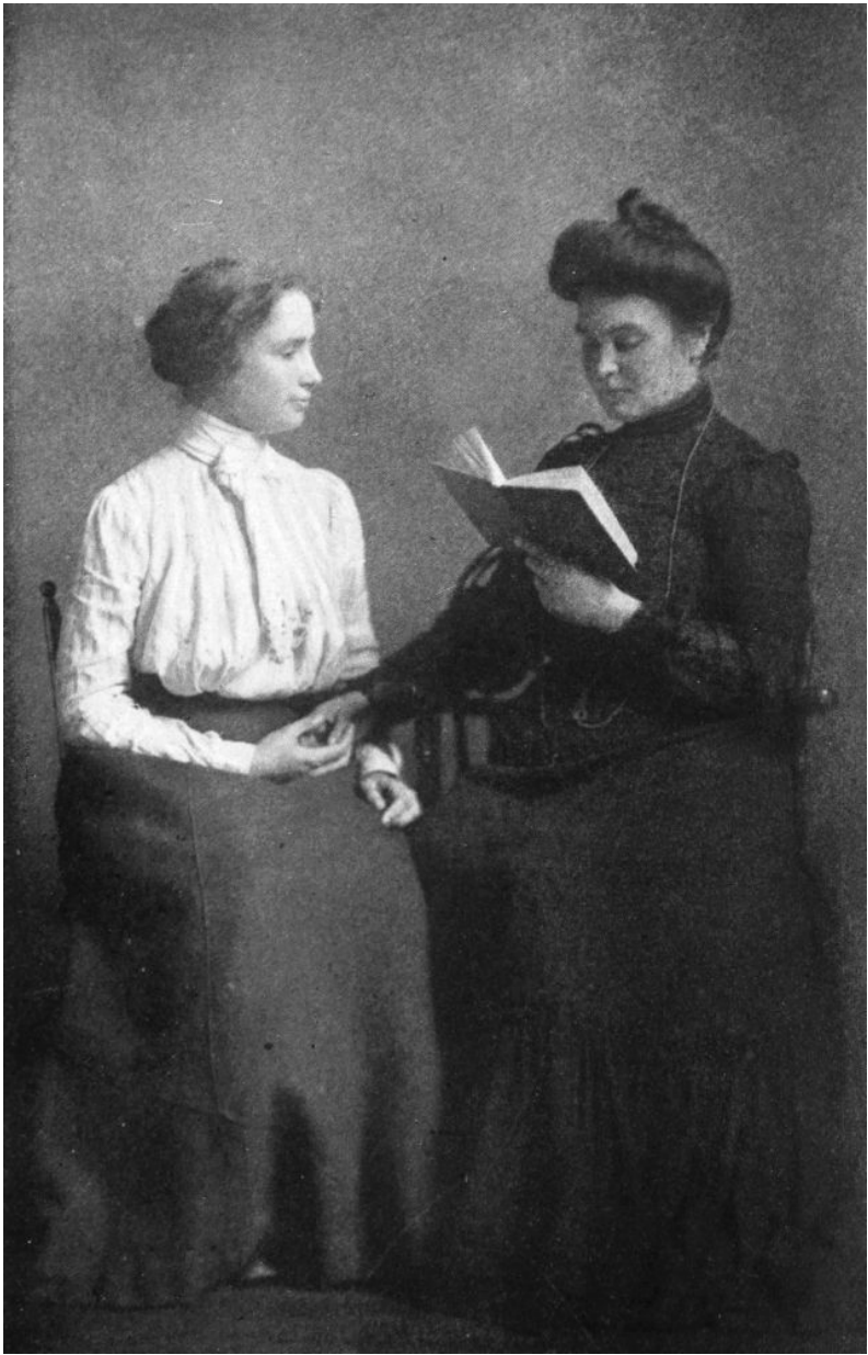
Photograph by A. Marshall, 1902