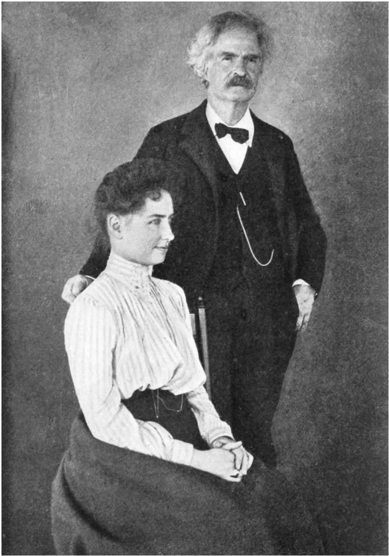
Photograph by E. C. Kopp, 1902