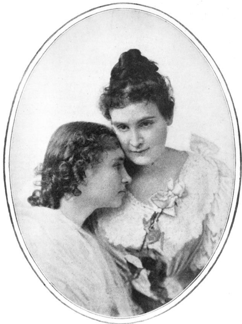
HELEN KELLER AND MISS SULLIVAN