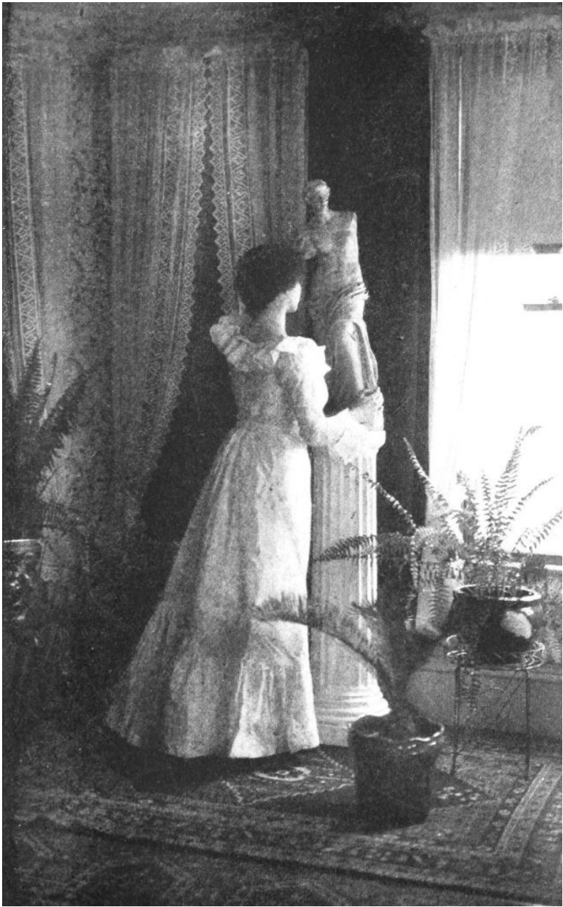
Photograph by Marshall, 1902 IN THE STUDY AT CAMBRIDGE