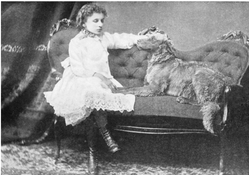
Photograph: by Deane, 1887

The deaf and the blind find it very difficult to acquire the amenities of conversation. How much more this difficulty must be augmented in the case of those who are both deaf and blind! They cannot distinguish the tone of the voice or, without assistance, go up and down the gamut of tones that give significance to words; nor can they watch the expression of the speaker's face, and a look is often the very soul of what one says.