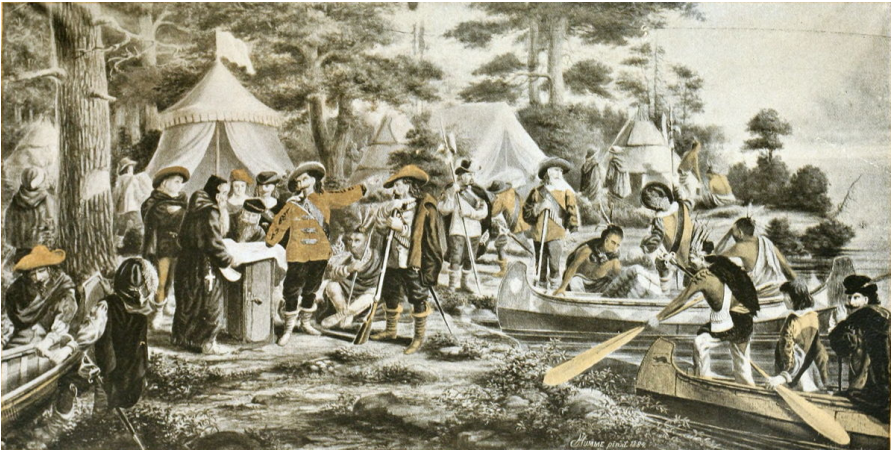
Champlain on the shores of Georgian Bay, 1615

the river as far as the Mattawan, which they followed westwards, and soon reached Lake Nipissing where they stopped for two days. This was on July 26th. After having taken this short rest, they continued their voyage, crossing Georgian Bay, and reached the land of the Hurons. Near the shore they met the Attignauantans, or people of the bear tribe, one of the four chief branches of the great Huron family. Their village or bourgade was called Otouacha. On the second day of August, Champlain's party visited the village of Carmeron, and on the following day, they saw the encampments of Tonaguainchain, Tequenonquiayé and Carhagouha. In the latter encampment Father Le Caron resided.