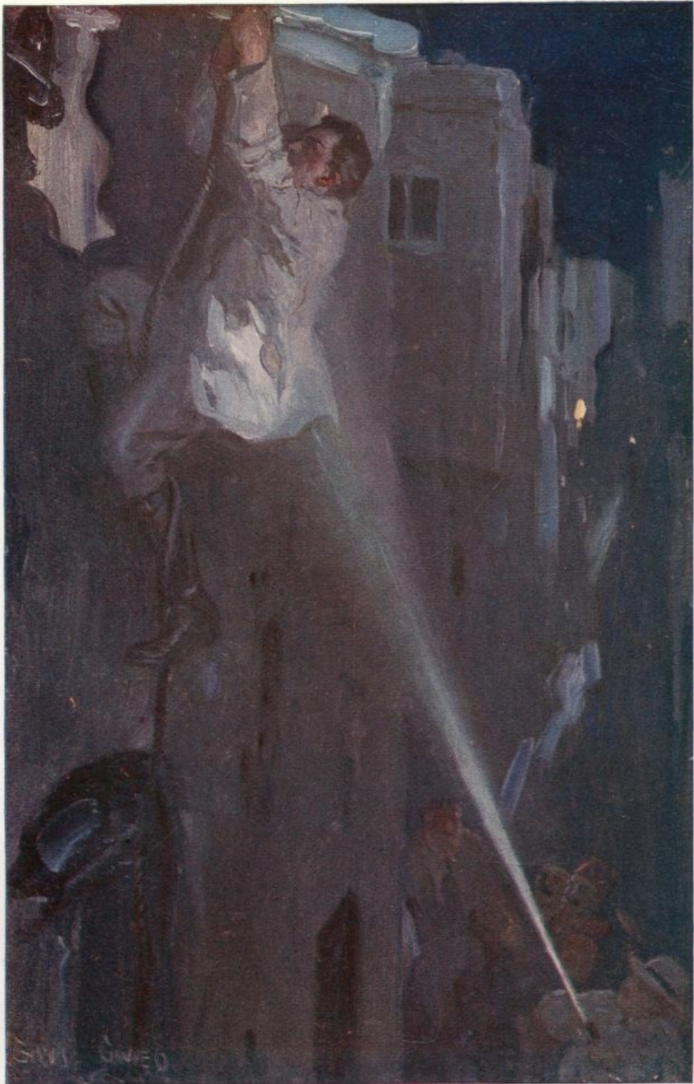
AT THE POINT OF DESPAIR