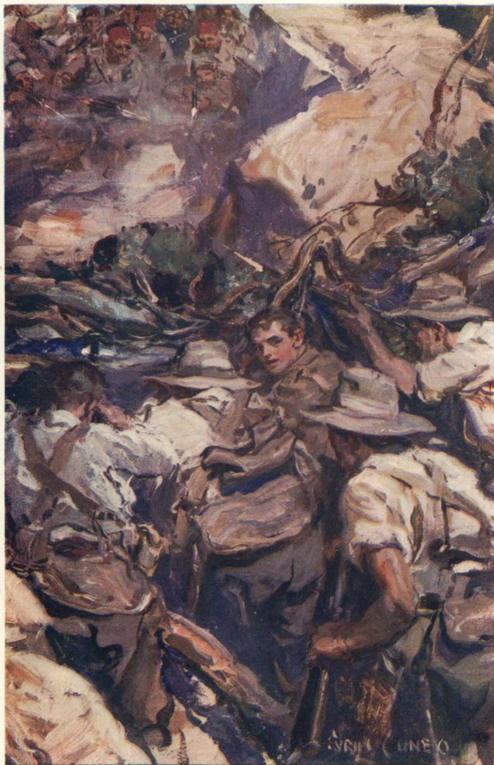
THE FIGHT IN THE GULLY