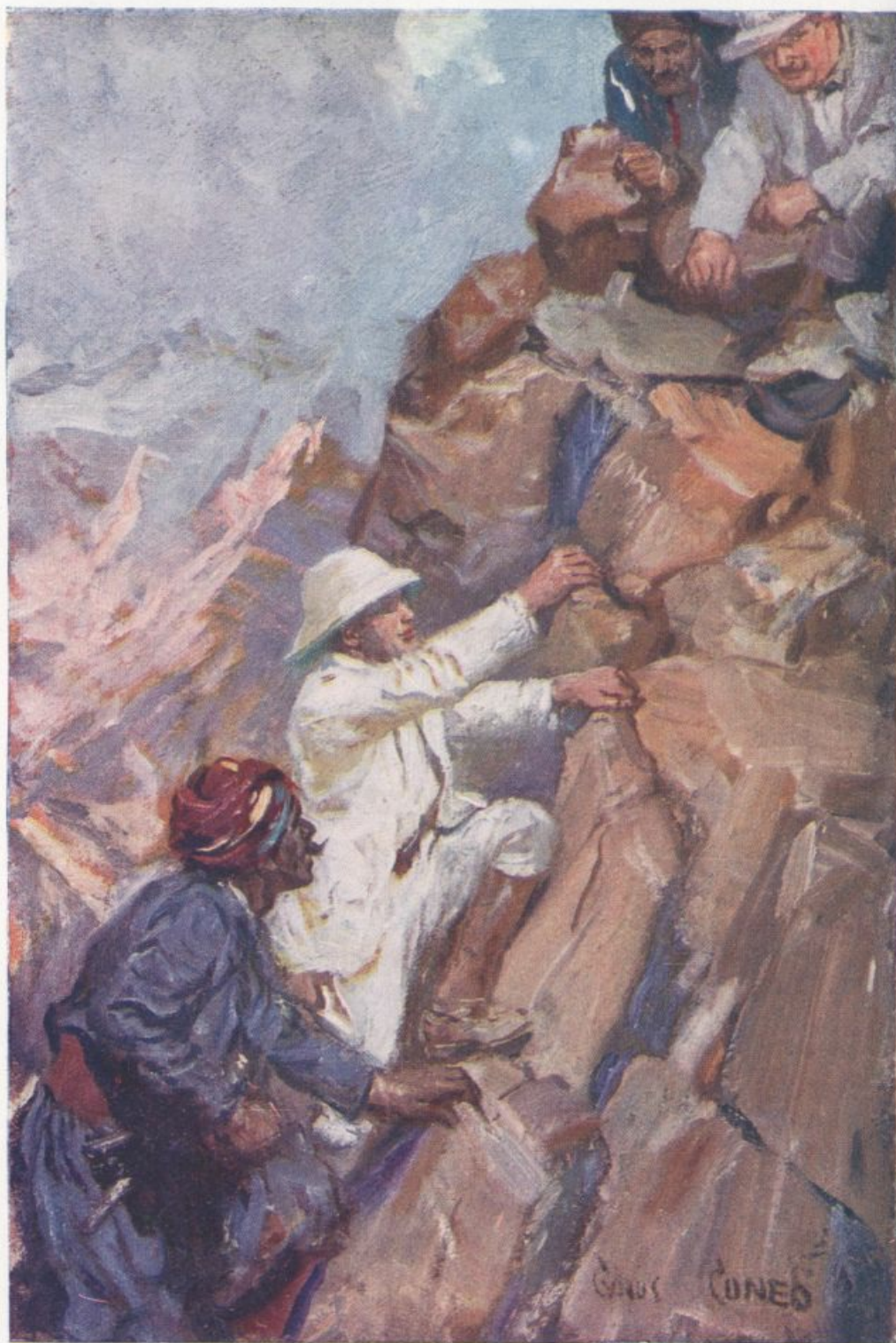
IN TWO MINDS