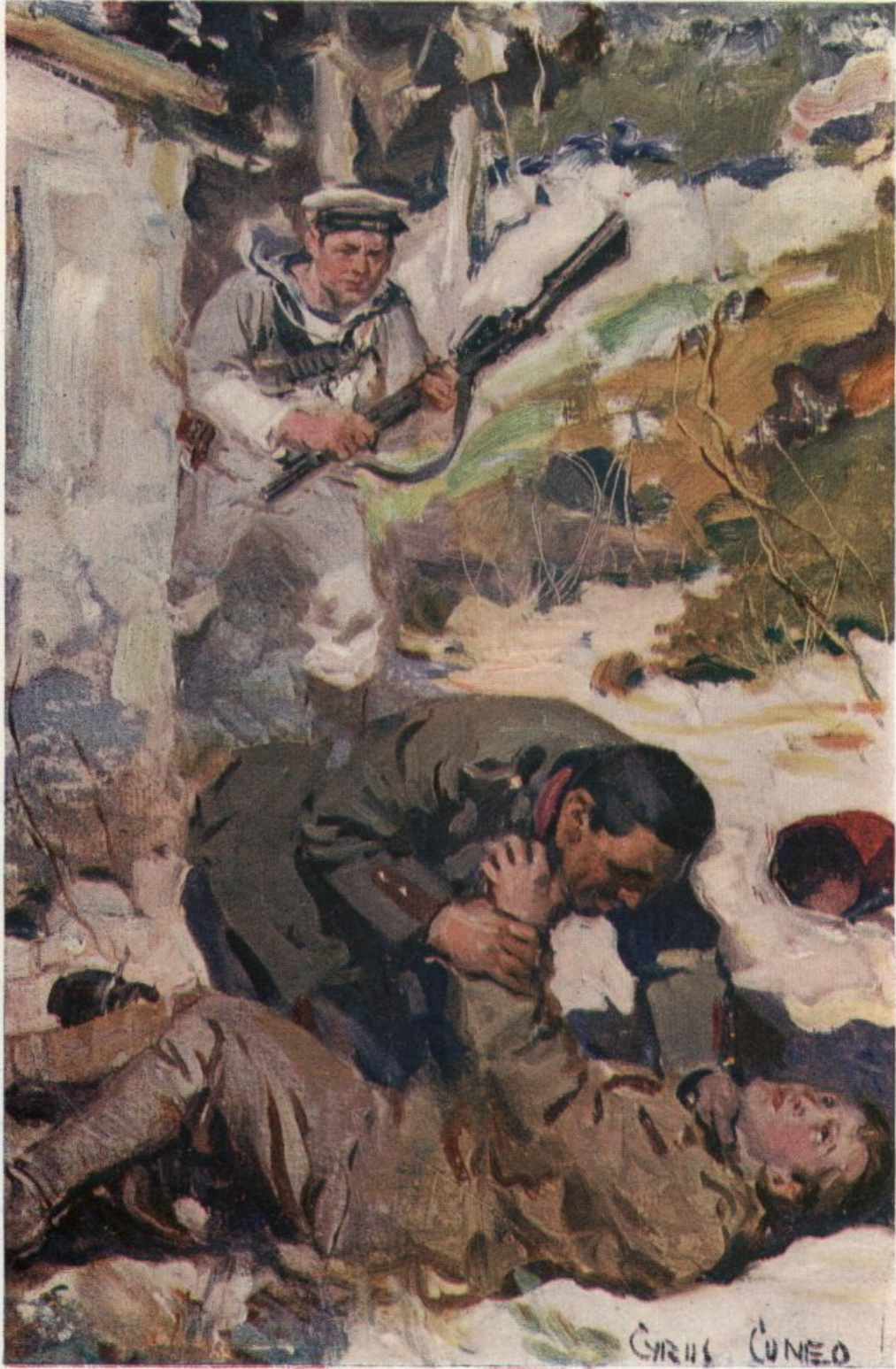
A CRITICAL MOMENT