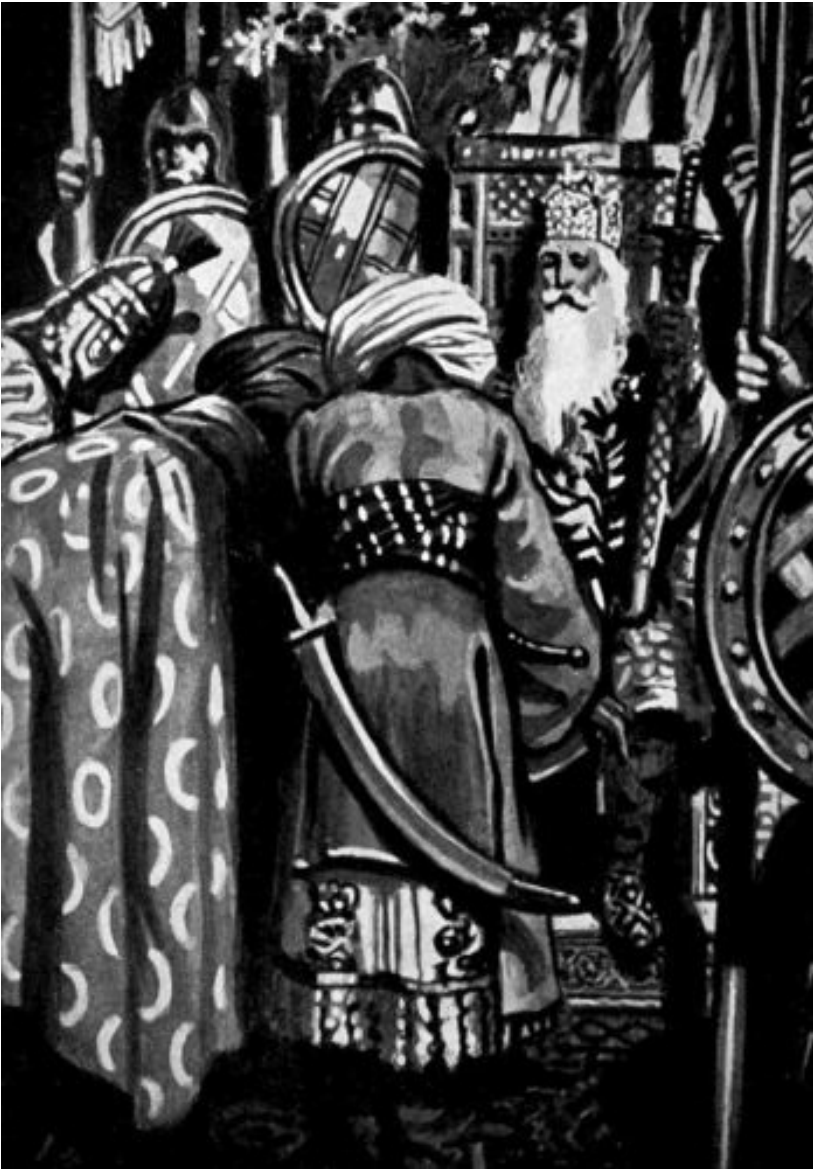
CHARLEMAGNE RECEIVING HIS GUESTS.