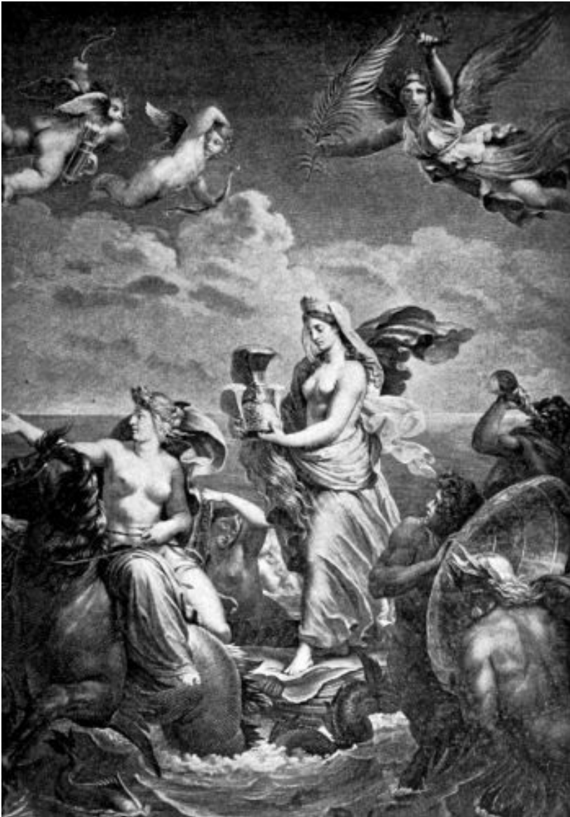
THETIS BEARING THE ARMOR OF ACHILLES.

The price still rising as in number less.”