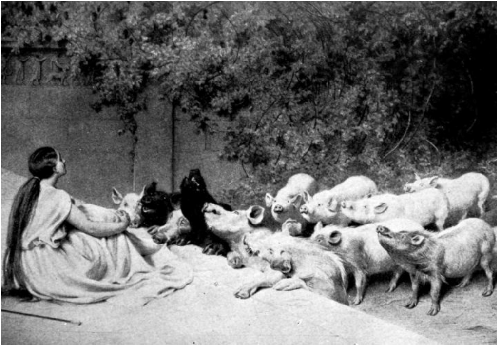
CIRCE AND THE FRIENDS OF ULYSSES. From painting by Briton Rivière.