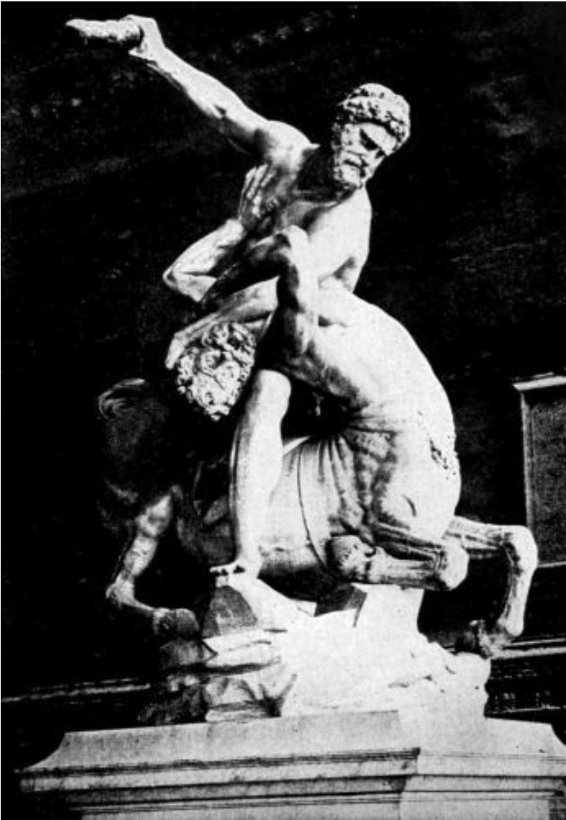
HERCULES IN BATTLE WITH A CENTAUR.