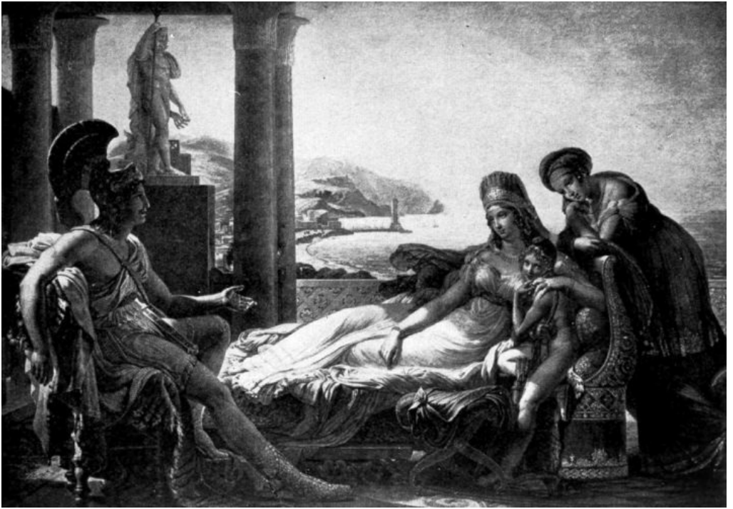
ÆNEAS AT THE COURT OF QUEEN DIDO. From painting by P. Guerin. Salon of 1817.