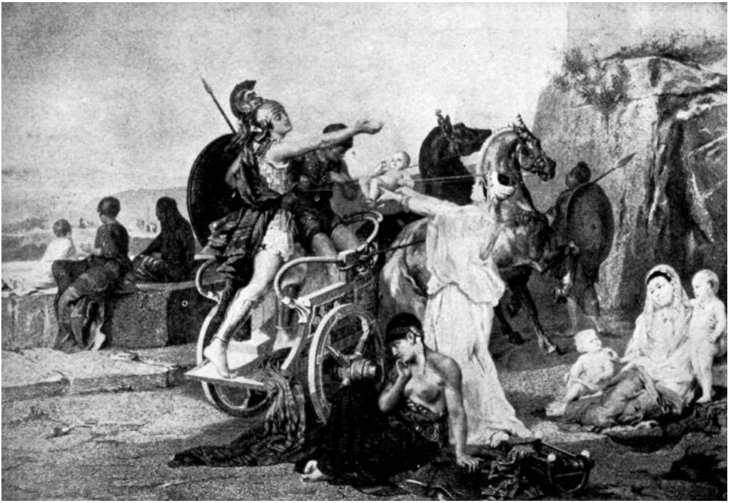
PARTING OF HECTOR AND ANDROMACHE.