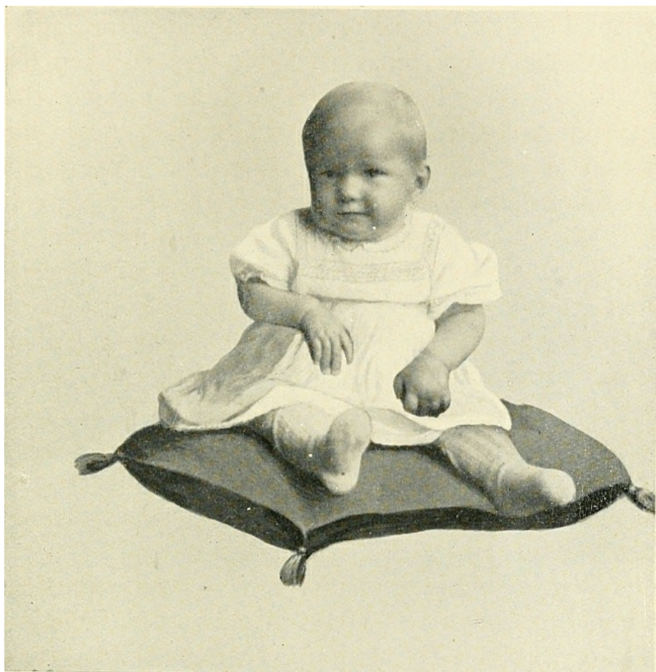
FIG. 1.—R. (age 9 months) attentively observant.

eighteen days, got the seeing look in her eyes, she contemplated her mother—that is, looked at her attentively; and in the period that followed she showed attentive observation of the patch of light on the ceiling over the lamp, of the unlighted hanging lamp, and so on. When she had reached the age of about nine and a half months, she had, however, quite a different power of fixing her attention on a particular object. She had looked at, felt, and tasted my magnifying glass; but it was time for me to go, and in order to get my glass back from her in a considerate manner I gave her a shining silver spoon with one hand while I took my glass with the other. She, however, followed the glass with her eyes, as I put it in my pocket, and let the spoon lie.