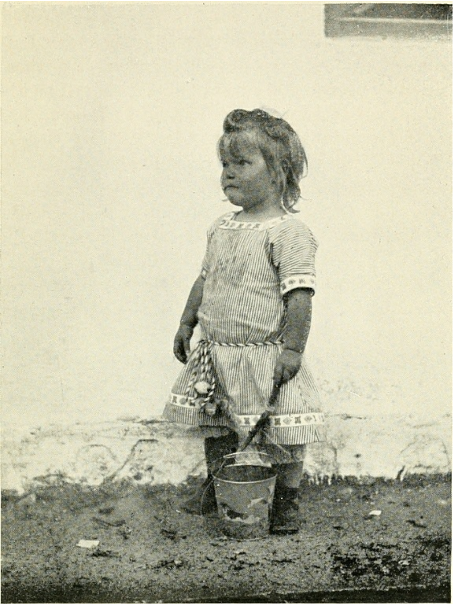
FIG. 5.—A picture of health.

Children are, however, much more interested in watching pictures being drawn or painted than they are in viewing the completed “works of art.” When R. was a year and a half she became highly excited when some one drew for her, but it was certainly the saying what animal was going to be drawn more than the picture itself that affected her so strongly. She herself began to draw