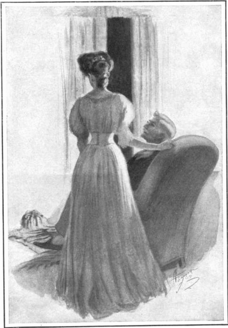
HE KNEW ALL ABOUT IT. HE IS SUCH A WISE OLD DAD.

He knew all about it. He is such a wise old dad. I never knew how wise before. I went to him last night. I had to go to somebody. He was in the library, poring over a book, but he looked up when I went in.