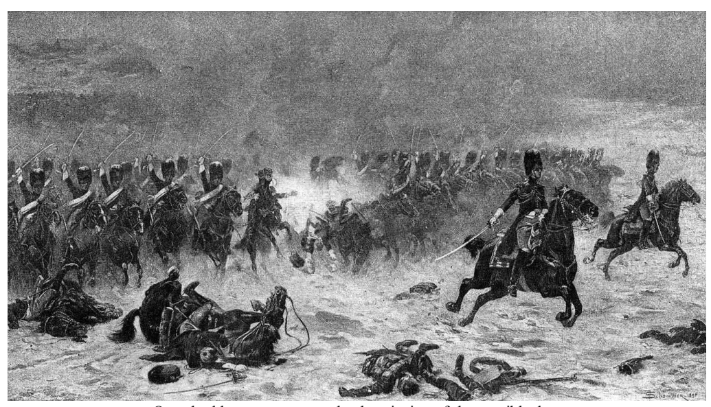
One shudders even now at the description of that terrible day. For twelve hours they fought without either side being able to claim the victory.