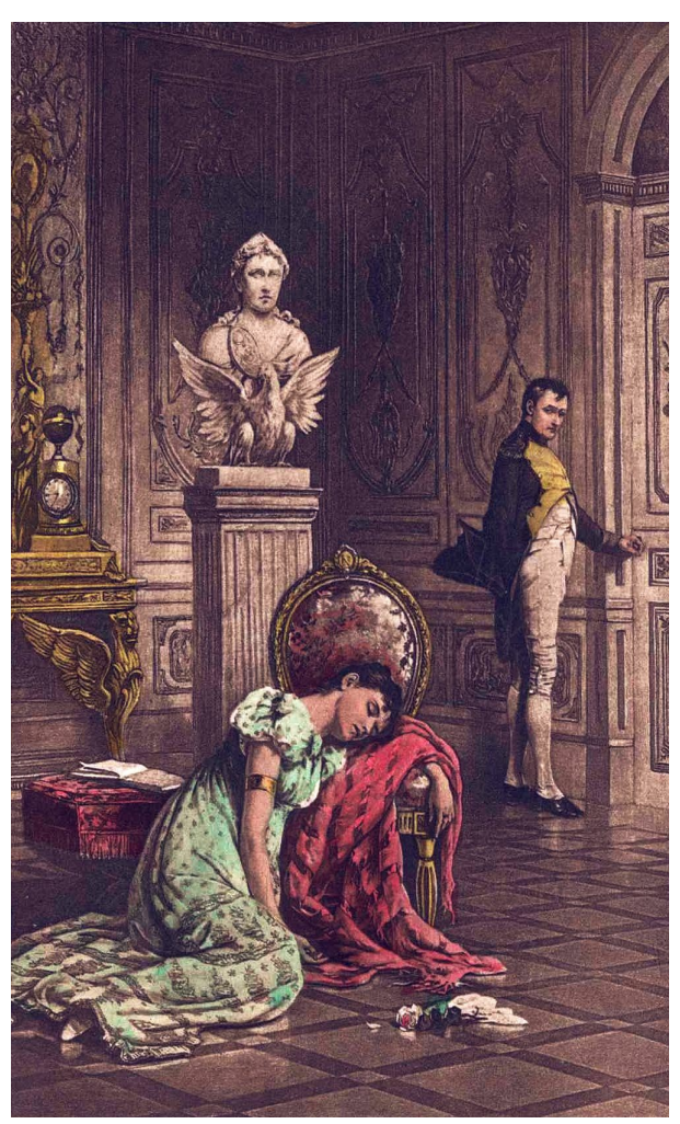
"My Poor Josephine, I Cannot Leave You"