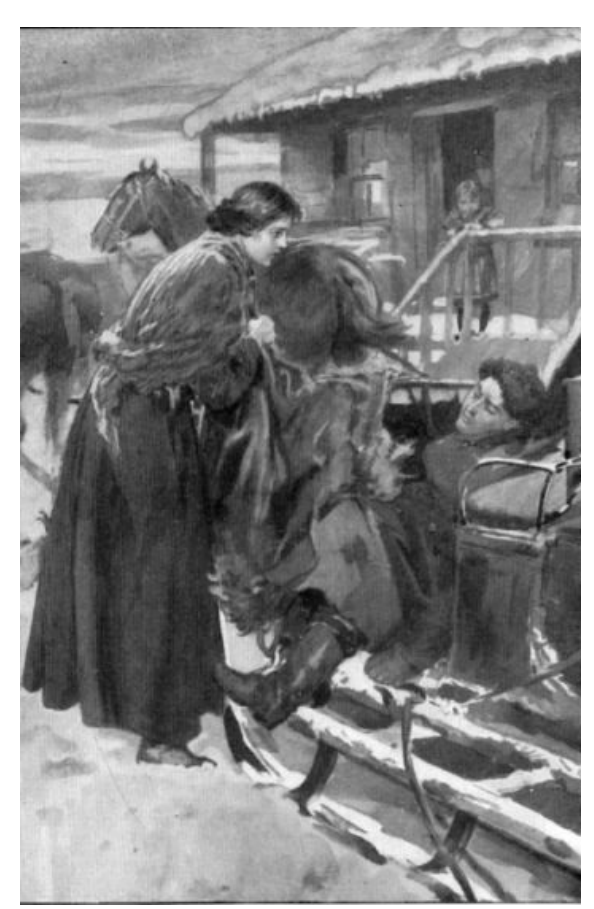
"THERE WAS A MAN LYING UNDERNEATH"