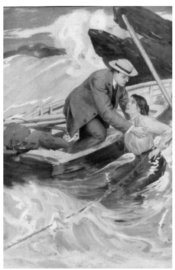
"SHE HAD REACHED THE BOAT"