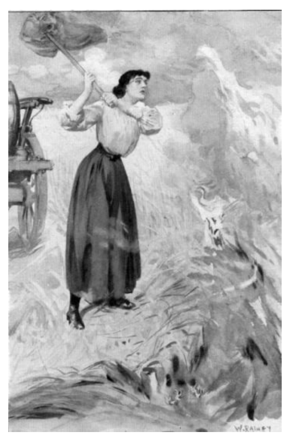
"SHE WAS MAKING NO HEADWAY"