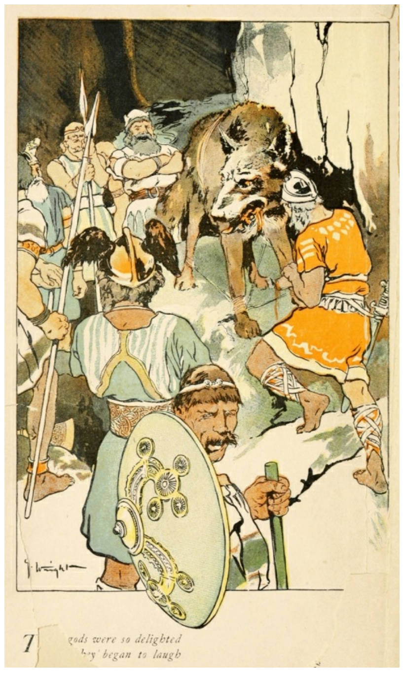
The gods were so delighted that they began to laugh