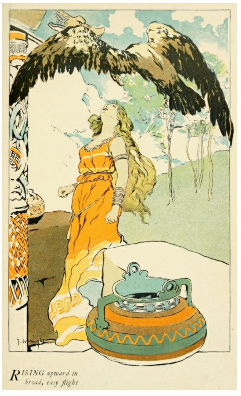
Rising upward in broad, easy flight

And now another wonderful change took place. Bolverk had entered as a worm, but no sooner had he drunk the mead than in an instant he became an eagle, and before Gunlad knew what had happened, with splendid wings