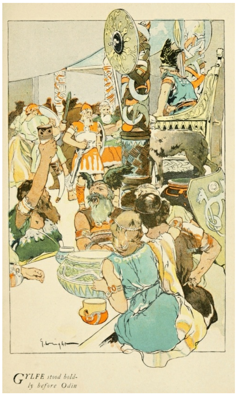
Gylfe stood boldly before Odin

Then Gylfe stood boldly before Odin,—a man standing in the presence of God and seeking for knowledge,—and asked many and deep questions about the