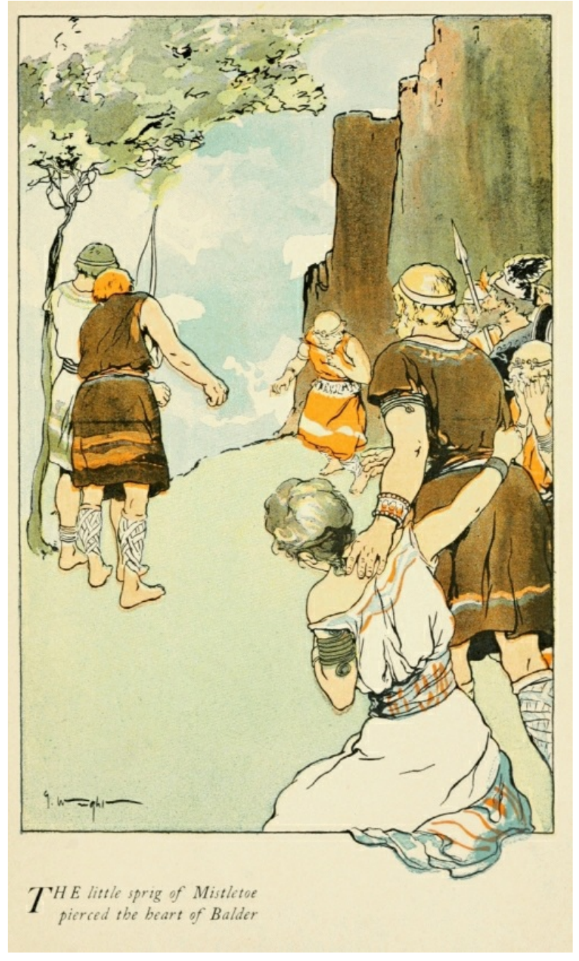
The little sprig of Mistletoe pierced the heart of Balder

"Because I cannot see where Balder stands, and have nothing to throw if I could," replied Hoder.