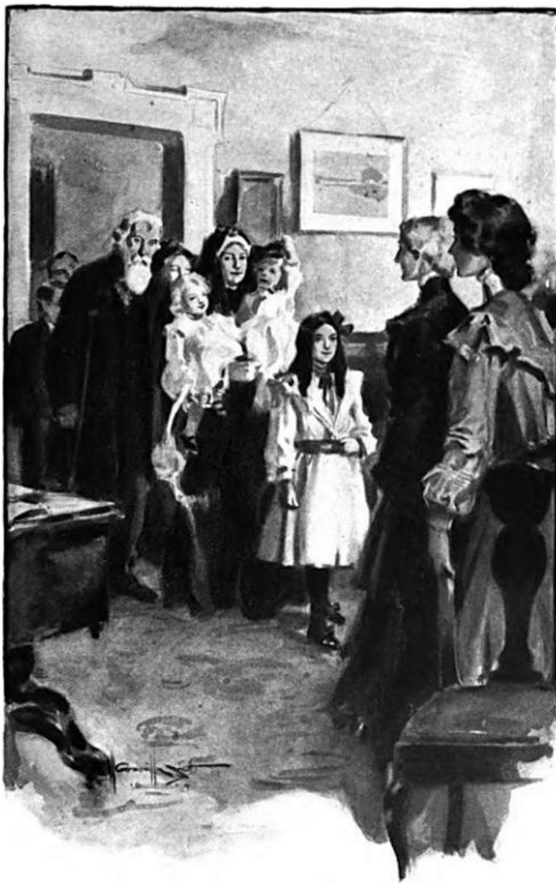
“Ladybird marshaling her guests”

The widow was of the affably helpless type, and encumbered as she was with fidgety impedimenta, found herself unable to offer the hand of fellowship.