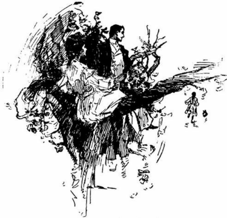
“Ladybird’s flying figure”