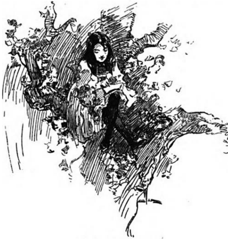
"Writing the letter"

Ladybird climbed one of her favorite apple-trees, settled Cloppy comfortably in her lap, and placing her paper pad on him as on a desk, prepared to write. A puckered brow was for a long time the only outward and visible sign of her inward and spiritual resolve to help her friend.