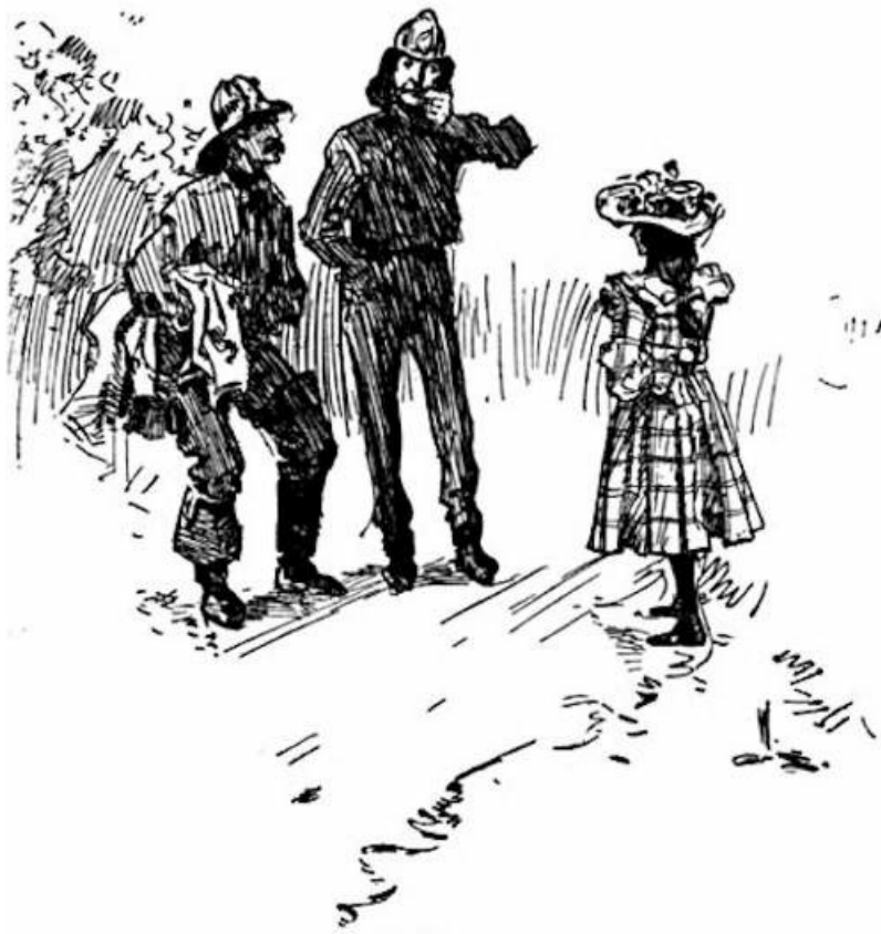
“The two firemen”

As Ladybird proceeded, her charity grew wider, and finally acknowledged no bounds either social or ethical.