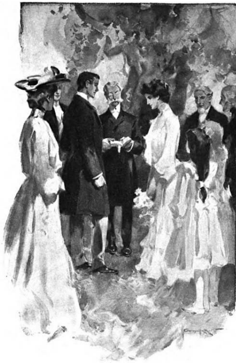
“The wedding under the trees”

Stella in white muslin and blue ribbons was a lovely country bride, and Lavinia and Ladybird, in more white muslin and more blue ribbons, were lovely country bridesmaids. Their rôles, however, were decidedly different, for while Lavinia was quietly sweet and amiably indifferent, Ladybird was the mainspring of the whole affair. She was more than ever like a will-o'-the-wisp. She attended to everything, and flew here and there with sparkling eyes and burning cheeks, in a wild state of excitement.