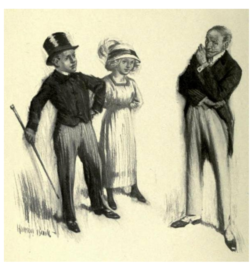
The Duke was staggered