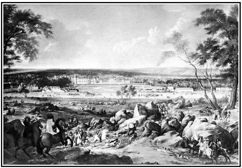
A Hunt at Fontainebleau

We are here since yesterday; having slept at the house of the Duc d'Antin, called Petit-Bourg, a charming residence; the gardens, especially, are magnificent. I did not come with the king, because two days before leaving Versailles I caught a bad cold in my head accompanied by a terrible cough, and I feared to disgust the king and make the young people laugh by spitting and blowing my nose; so I came in my own carriage with my ladies and dogs. Yesterday they hunted, but I could not go; it used to be great pain to me to lose a hunt, but now I do not care.