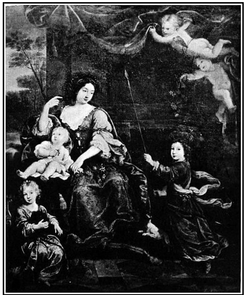
The Dauphine wife of Monseigneur