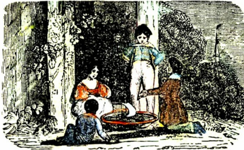
THE TOY SHIP.