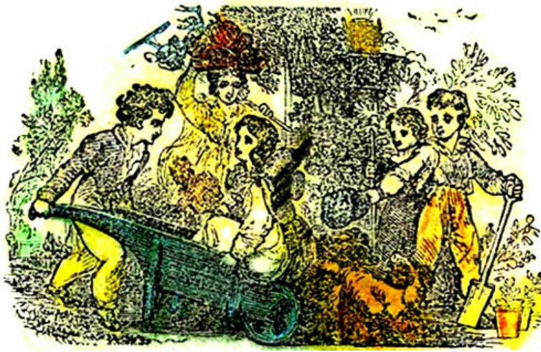
THE LITTLE GARDENERS.

One day, early in the Spring, the little folks took it into their heads to build an arbor in their garden. So, getting their mother's consent, they applied to the gardener, who furnished them with some stout poles and strips of boards necessary for their purpose. Accordingly, they were soon industriously engaged in their first essay at building.