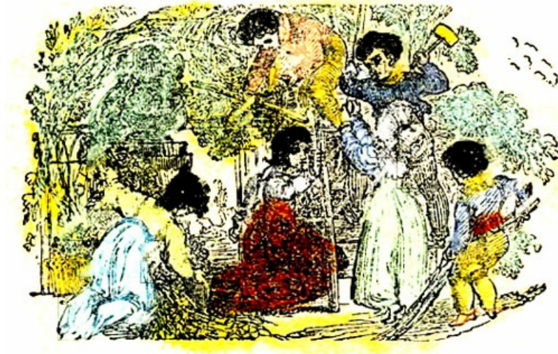
BUILDING THE ARBOR.