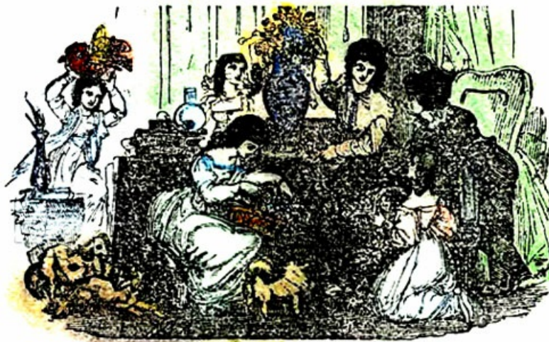
ARRANGING THE BOUQUETS.

When these plants were in full bloom, the arbor presented a lovely appearance, and was filled with the most delightful fragrance. Here our little gardeners retired when they were fatigued with their labors, or when the heat of the sun prevented their working in the garden.