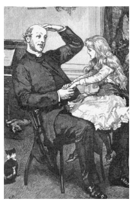
"YOU ARE THE YOUNG CANON" Click to ENLARGE

"Ah!" said the Canon, rubbing his bald head, "there are degrees of comparison, and I am afraid it is old, older, olderer, and oldest, in the cathedral chapter. But I wanted to tell you that at San Remo you will have playfellows—nice little girls and boys, who are living there with their grandmother; and that is what we cannot find for you in Coldchester."