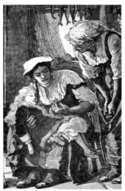
"DOROTHY FELL FAST ASLEEP.' Click to ENLARGE

in the square, and made the windows glitter and shine like stars.