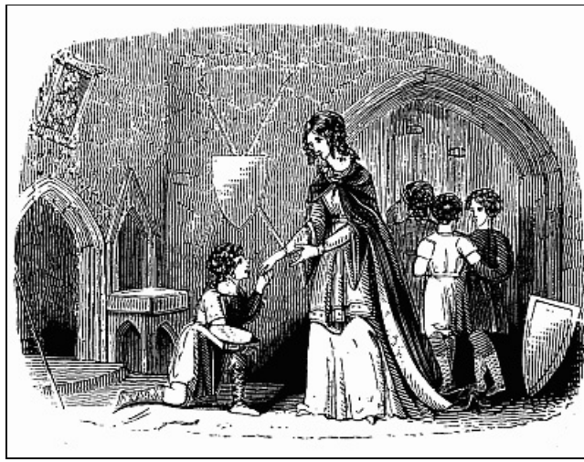
Prince Alfred rewarded by the Queen.

"Lady, I believe you," replied Alfred; "I have already proved the sweetness of the paths that lead to knowledge, and require no further inducement to tempt me to pursue them."