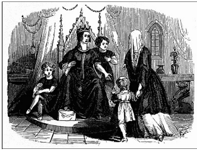
The Queen of Scotland receiving Queen Margaret.

"He is of the same age as thine own fair son, my royal sister," said Queen Margaret; "and think what would be thy feelings if thou couldst behold him exposed to the same sad reverse of fortune, and reduced to the dire distresses through which my princely boy has recently passed."