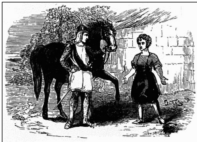
The Count de Boulogne and Fitz-Arthur.

"For the love of Heaven, kind smith," cried he, "have pity upon me, and see what is the matter with my horse's foot!"