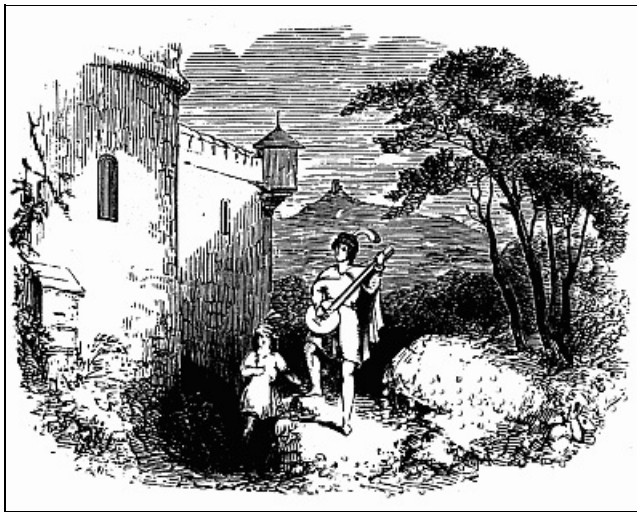
Blondel discovering Richard Cœur de Lion.

You may imagine the joy of Blondel and George at having discovered where he was. Blondel, still accompanying his voice with the lute, sang to his royal master an account of everything that had taken place in England, and how his brother, Prince John, had taken advantage of his absence to usurp the sovereign power. King Richard, in reply, sang some verses requesting Blondel to tell his mother and his wife where he was, and to beg them to appeal to the pope (who had absolute power over all the princes in Europe) to obtain his deliverance from the emperor and the Duke of Austria.