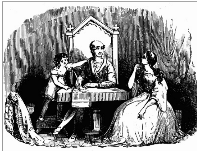
Lady de Mettingham and the Scribe.

William de Stagno begged the Lady not to make herself uneasy on that account. "Both my scribe and myself," said he, "are willing to render any service or courtesy to the wife and son of a valiant crusader, without looking for reward. Nevertheless," continued he, "there be some among the inhabitants of this town, who will do naught for foreign strangers unless they be paid beforehand. It is well, therefore, for those who require letters to be written, if they can play the scribe for themselves; otherwise they must be content to send verbal messages to their friends, by those who will undertake to carry them for nothing."