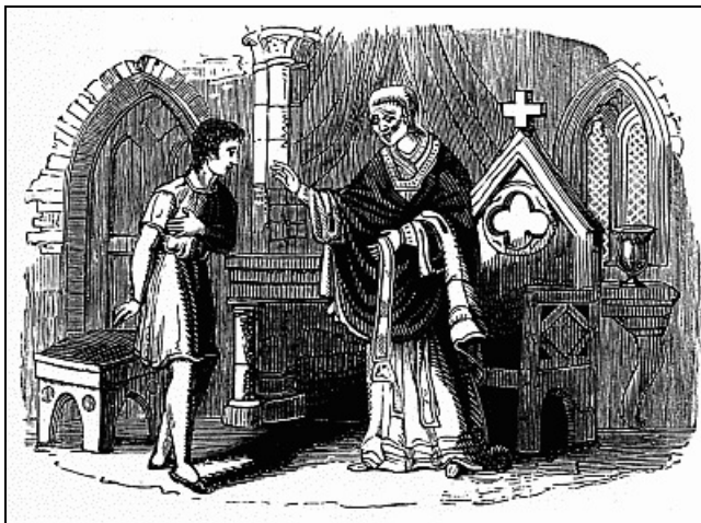
Attalus and his Grandfather.

"But," said Attalus, in reply to the apprehensions which his grandfather had expressed on this subject, "the King of Austrasia is a Christian, I am told."