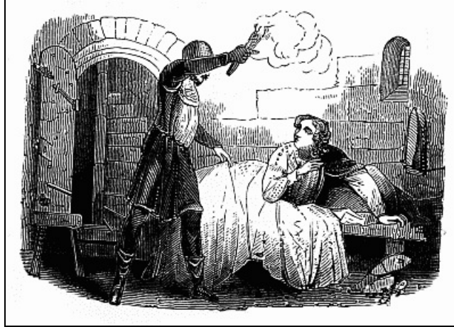
Prince Arthur awakened by his Jailer.

"It is to be hoped that the princely youth, when he found himself thus cut off from all hopes of an earthly crown, and deprived of the society of his fond mother, beloved sister, and all his friends and attendants, employed his solitary hours in holy meditation and prayer to God. He might thus hope to obtain a heavenly inheritance, that fadeth not away, in the place of that perilous greatness which had proved so sorrowful a birthright to him.