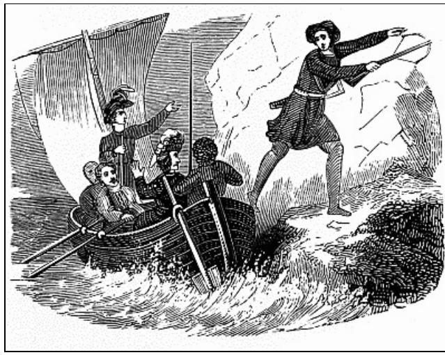
William Tell escaping from the Boat.

As the prow of the vessel was driven inland, Tell perceived a solitary table-rock, and called aloud to the rowers to redouble their efforts, till they should have passed the precipice ahead. At the instant they came abreast this point, he snatched his bow from the plank, where it was lying forgotten during the storm, and, turning the helm suddenly towards the rock, he sprang lightly on shore, scaled the mountain, and was out of sight, and beyond reach of pursuit, before any person on board had recovered from his consternation.