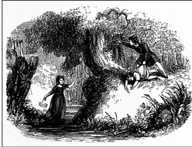
Edwy saved by Selred.

Once, when she took it into her head to wade into the brook, in quest of river-muscles, she carelessly left little Edwy playing among the wild flowers on the steep bank: and he, suddenly missing her, crept to the very edge to look for her, crying "Gith! Gith!" which was his way of calling Edith. He would have fallen into the water and probably been drowned, if Selred, who perceived his danger, had not luckily caught him by the clothes, just as he was on the point of rolling down the bank.