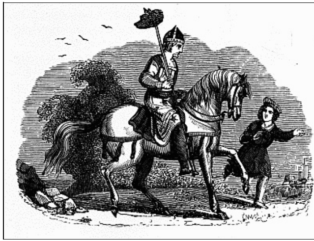
King Edgar with the head of the Were-Wolf.

The other eight kings had just returned from hunting, weary, and without game; and the streets were crowded with people, who seemed disappointed at their want of success. At the appearance of King Edgar, who rode into the city at full speed, bearing the were-wolf's head upon his spear, they rent the air with shouts of exultation, and attended him to the palace with loud and continued acclamations.