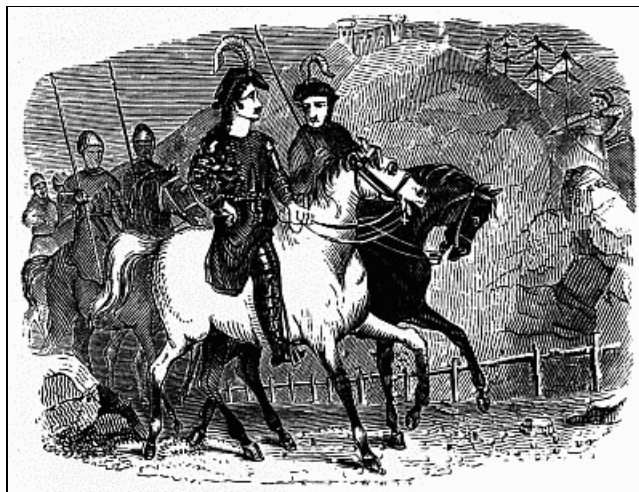
Gessler slain by William Tell.

The arrow flew as truly to the mark as that which he had shot in the market-place of Altdorf; and the tyrant Gessler fell from his horse, pierced with a mortal wound.