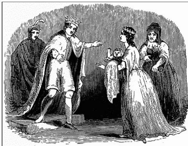
Queen Margaret presenting her Infant to the King.

King Henry and Queen Margaret never had any other child beside the Prince Edward. He was a child of singular beauty and rare endowments, and was, of course, most tenderly beloved by them both; but his birth was the cause of great discontent to Richard Plantagenet, Duke of York, King Henry's cousin, who was considered by some people to have had a better right to the crown than King Henry himself.