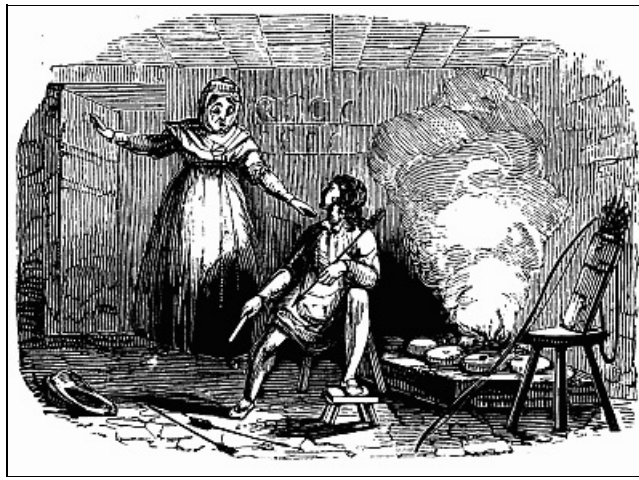
Alfred the Great in the Herdsman's cottage.

Alfred, whose mind was occupied with sorrowful reflections on the miserable condition of his beloved country, continued to employ his hands in feathering his arrows from the wing of a wild-goose, without raising his eyes, or bestowing a single thought on the bread that had been so earnestly commended to his care, till the precious cakes caught fire, and the indignant Switha was attracted by the smell of their burning.