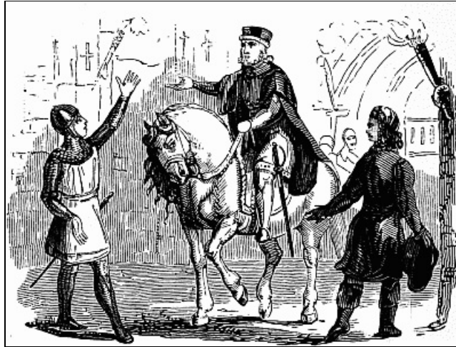
The Earl of Flanders and Sir Robert Mareschant.

"Whist! whist! my lord," cried Sir Robert Mareschant, one of the earl's knights, who had come in search of his sovereign. "This is no time to peal the battle word of Flanders. Some traitor hath opened one of the gates to the rebels of Ghent, and the town is full of the White-Hoods."