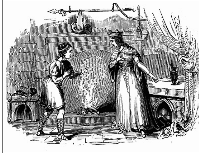
Bladud receiving a Ring from his Mother.

How sweet, how consoling, would have been the answer of a Christian parent to this agonizing question; but on Bladud's mother the heavenly light of Revelation had never shone. She knew not how to speak comfort to the breaking heart of her son, in those cheering words of Holy Writ, which would have been so applicable to his case in that hour of desertion: When thy father and thy mother forsake thee, I will take thee up. She could only weep with her son, and try to soothe his sorrow by whispering a hope, which she was far from feeling, that the day might come, when he could return to his father's court, cured of the malady which was the cause of his banishment.