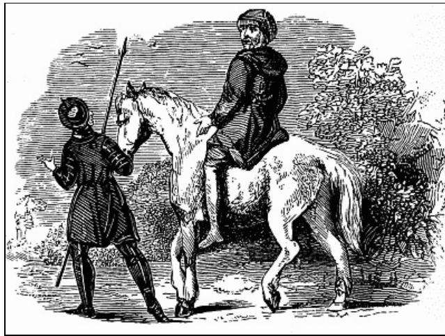
The Earl of Flanders escaping in disguise.

"This is no time or place to tell adventures," replied the earl. "Get me a horse, if you can, for I am weary of walking. And, in the mean time, let us take the road to Lisle, if thou knowest it."