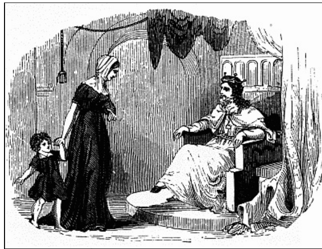
The widowed Mother begging protection.

"Who are ye?" said the king, when the mournful widow and her son, in obedience to his encouraging sign, advanced, and bowed the knee before him.