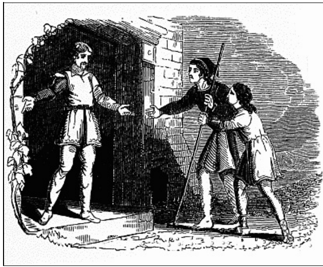
Attalus and Leo relieved by a Christian.

Leo shuddered at this barbarous speech, and Attalus scarcely ventured to draw his breath! At length the blood-thirsty Franks, after bestowing a wicked execration on the sour plums, which, having tasted, they did not approve, turned their horses about, and struck into another track.