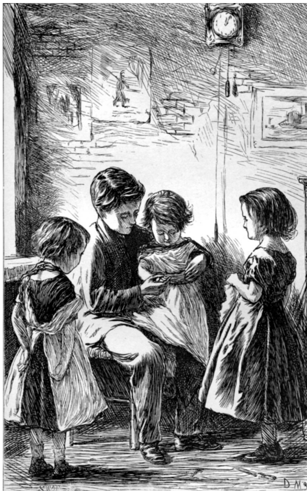
The Cut Finger. Click to ENLARGE

"Well! I'm sure, Tom, you've tied it up as neatly as I could have done. I wish I'd always such an one as you to see after the children; but you must run off now, lad, your mother was calling you as I came in, and I said I'd send you—good-by, and thank you."