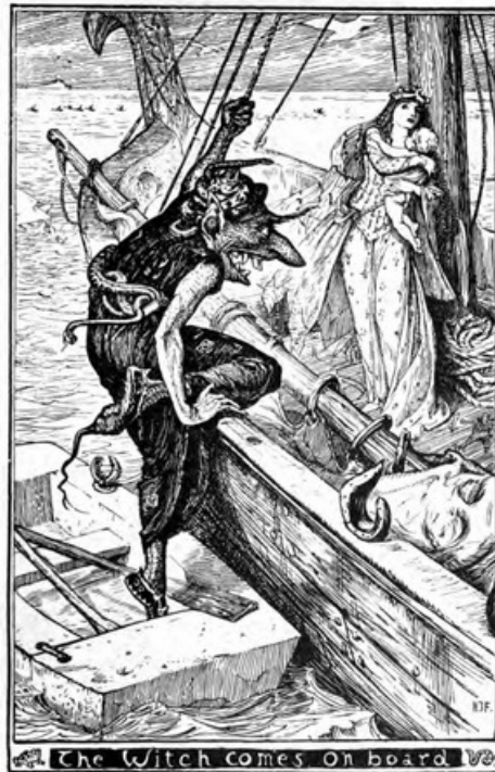
The Witch comes on board.

He came to the King and asked his daughter's hand, which he readily granted him, but only on the condition that he should remain there as long as he could, for the King himself was not strong and not very able to govern his kingdom. Sigurd accepted this condition, but added that he would have to get leave to go home again to his own country when he heard news of his father's death. After that Sigurd married the Princess, and helped his father-in-law to govern the kingdom. He and the Princess loved each other dearly, and after a year a son came to them, who was two years old when word came to Sigurd that his father was dead. Sigurd now prepared to return home with his wife and child, and went on board ship to go by sea.