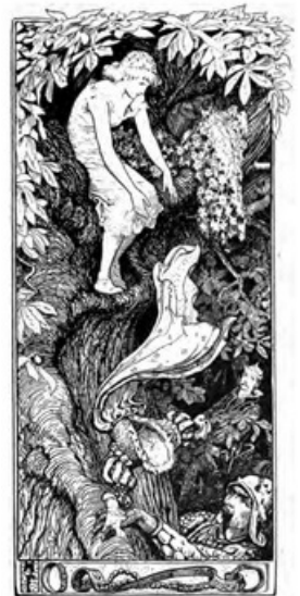
And then her dress'

When she was led to the stake, she laid the shirts on her arm, and as she stood on the pile and the fire was about to be lighted, she looked around her and saw six swans flying through the air. Then she knew that her release was at hand and her heart danced for joy. The swans fluttered round her, and hovered low so that she could throw the shirts over them. When they had touched them the swan-skins fell off, and her brothers stood before her living, well and beautiful. Only the youngest had a swan's wing instead of his left arm. They embraced and kissed each other, and the Queen went to the King, who was standing by in great astonishment, and began to speak to him, saying, 'Dearest husband, now I can speak and tell you openly that I am innocent and have been falsely accused.'