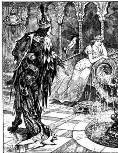
The Wizard King pays a visit to the Princess

When he saw her well-disposed towards him, he exclaimed: 'Madam, I have a most important secret to confide to you, and I beg you not to be alarmed by what I am about to say. I am here on behalf of the Queen your mother, with the object of delivering your Highness; to prove which, behold this portrait which she gave me herself.' So saying he drew forth the miniature from under his wing. The Princess's surprise was great, but after what she had seen and heard it was impossible not to indulge in hope, for she had recognised the likeness of herself which her mother always wore.