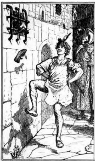
'He was skipping along so merrily'

In the morning the King and the Queen saw plainly where their daughter had been, and they took the Soldier and put him into prison.