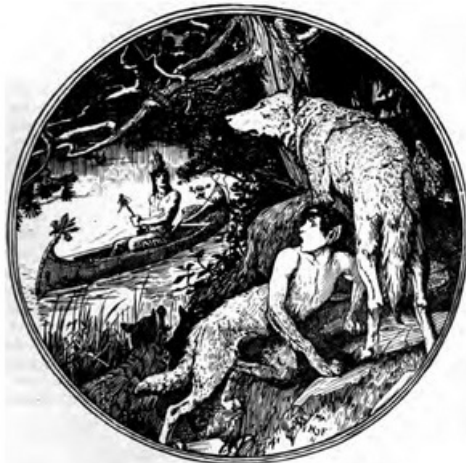
'My brother, my brother, I am becoming a wolf!'

But he would not listen, and, making no reply, he took his bow and arrows and left the hut. The snows fell and melted, yet he never returned; and at last the heart of the girl grew cold and hard, and her little boy became a burden in her eyes, till one day she spoke thus to him: 'See, there is food for many days to come. Stay here within the shelter of the hut. I go to seek our brother, and when I have found him I shall return hither.'