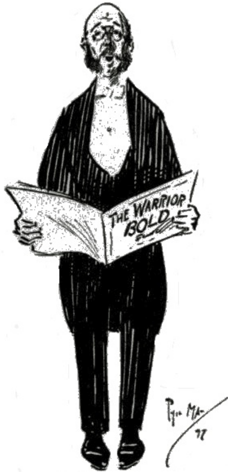
"The Warrior Bold."