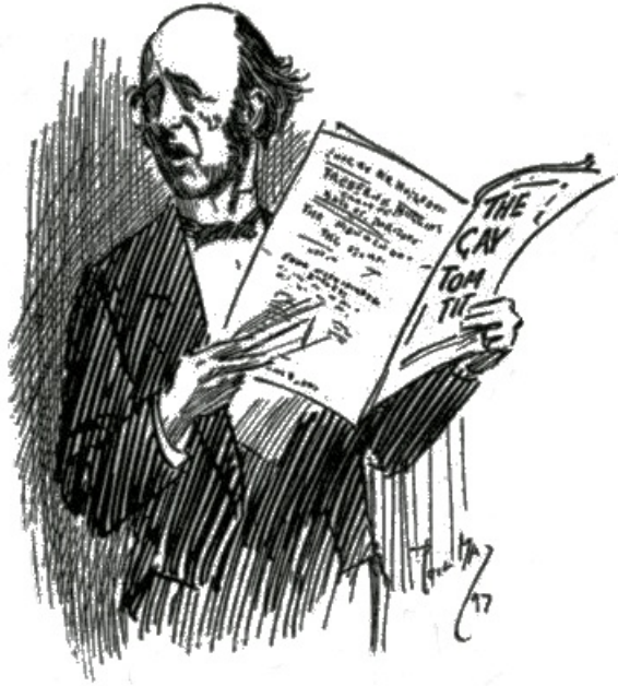
"The Gay Tom Tit."