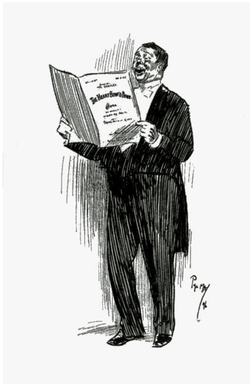
"The Heart Bow'd Down."