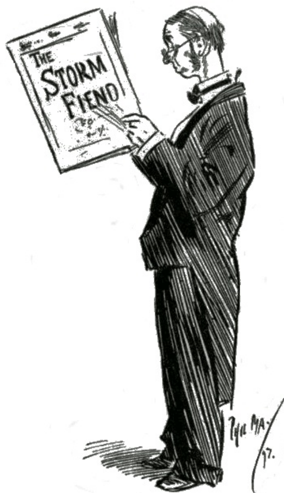
"The Storm Fiend."