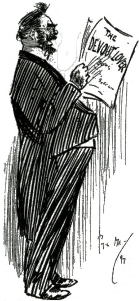
"The Devout Lover."