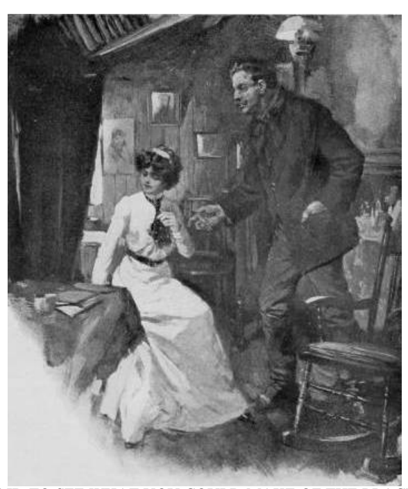
"WOULD YOU BE AFRAID TO SEE WHAT YOU COULD MAKE OF THE PLACE AND ME?" —Page 242

"Then," she said, "I'll do what I can, Gregory."