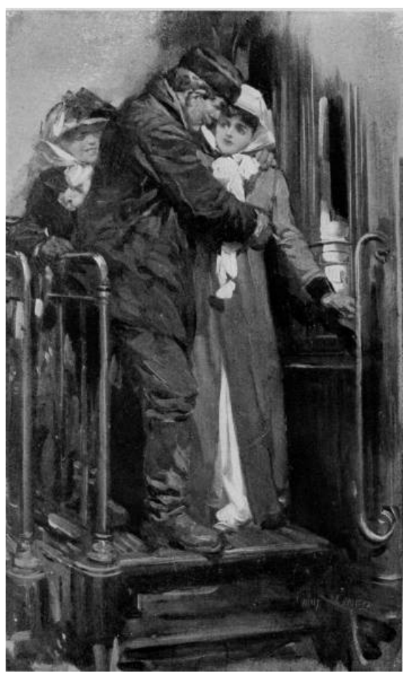
"SHE WAS CONSCIOUS OF A CERTAIN SHRINKING FROM HIS EMBRACE"—Page 107

she had last seen it. The joyous sparkle that she remembered had gone out of the eyes. They were harder, bolder, than they used to be. The mouth was slack—it looked almost sensual—and the man's whole personality seemed to have grown coarser. As she thrust the disconcerting fancies from her the car stopped.