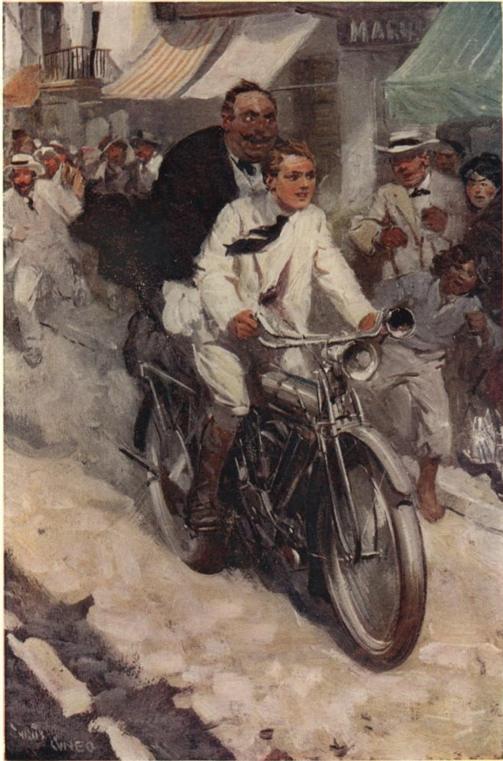
THE GOVERNADOR RIDES