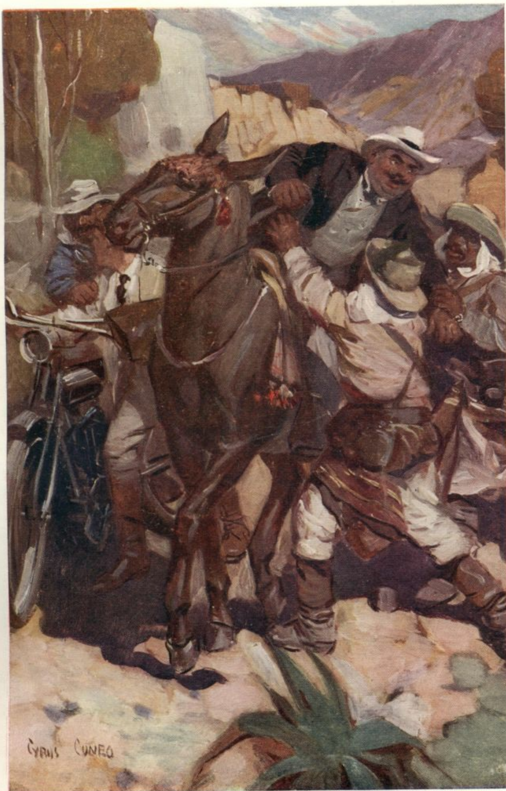
CAPTURED BY BRIGANDS