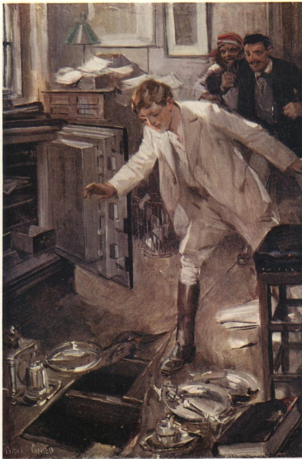
THE HOLE IN THE FLOOR