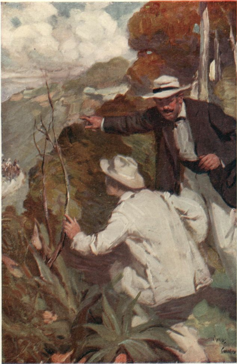
HORSEMEN ON THE TRACK