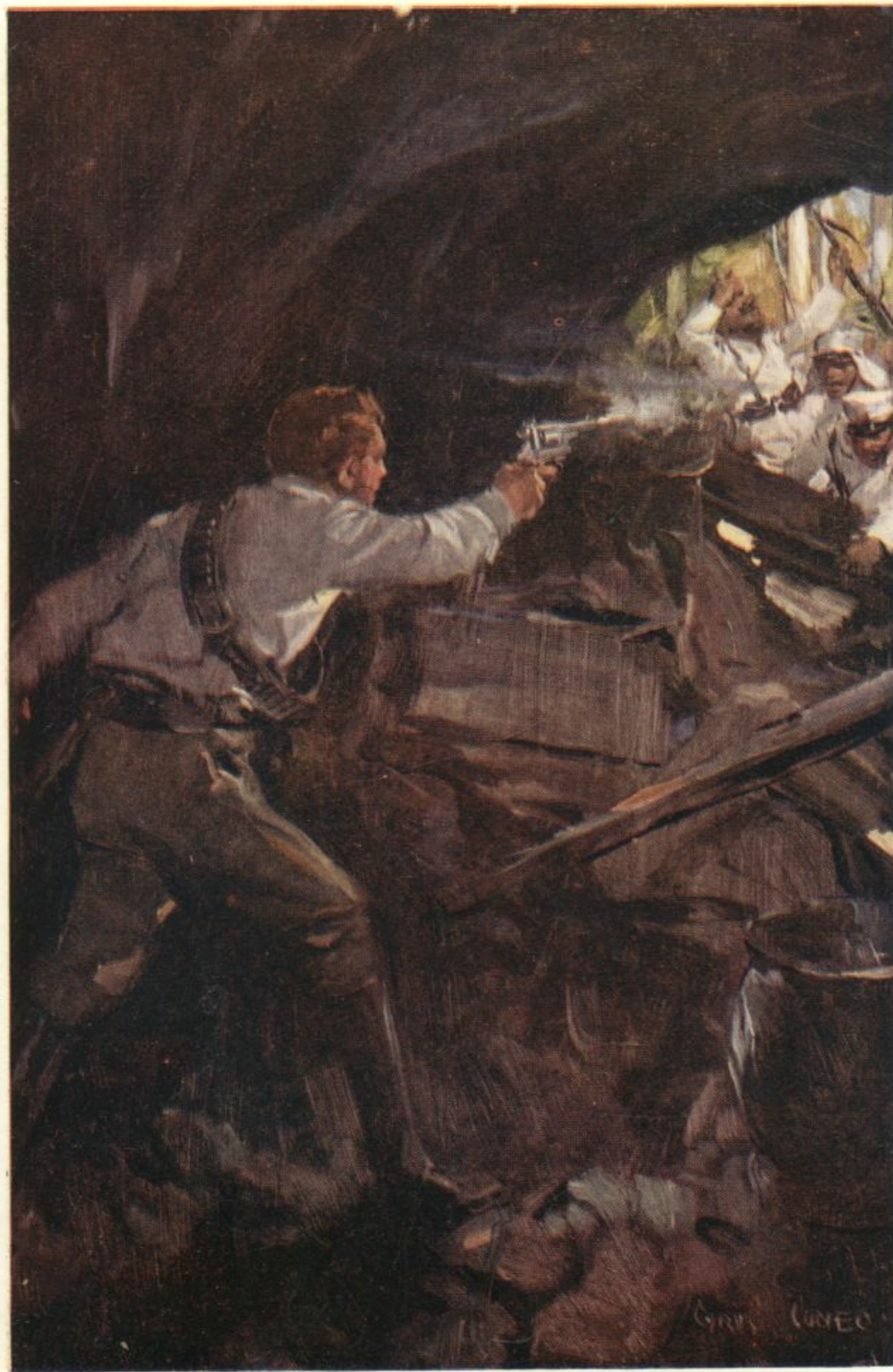
A CHECK AT THE CAVE