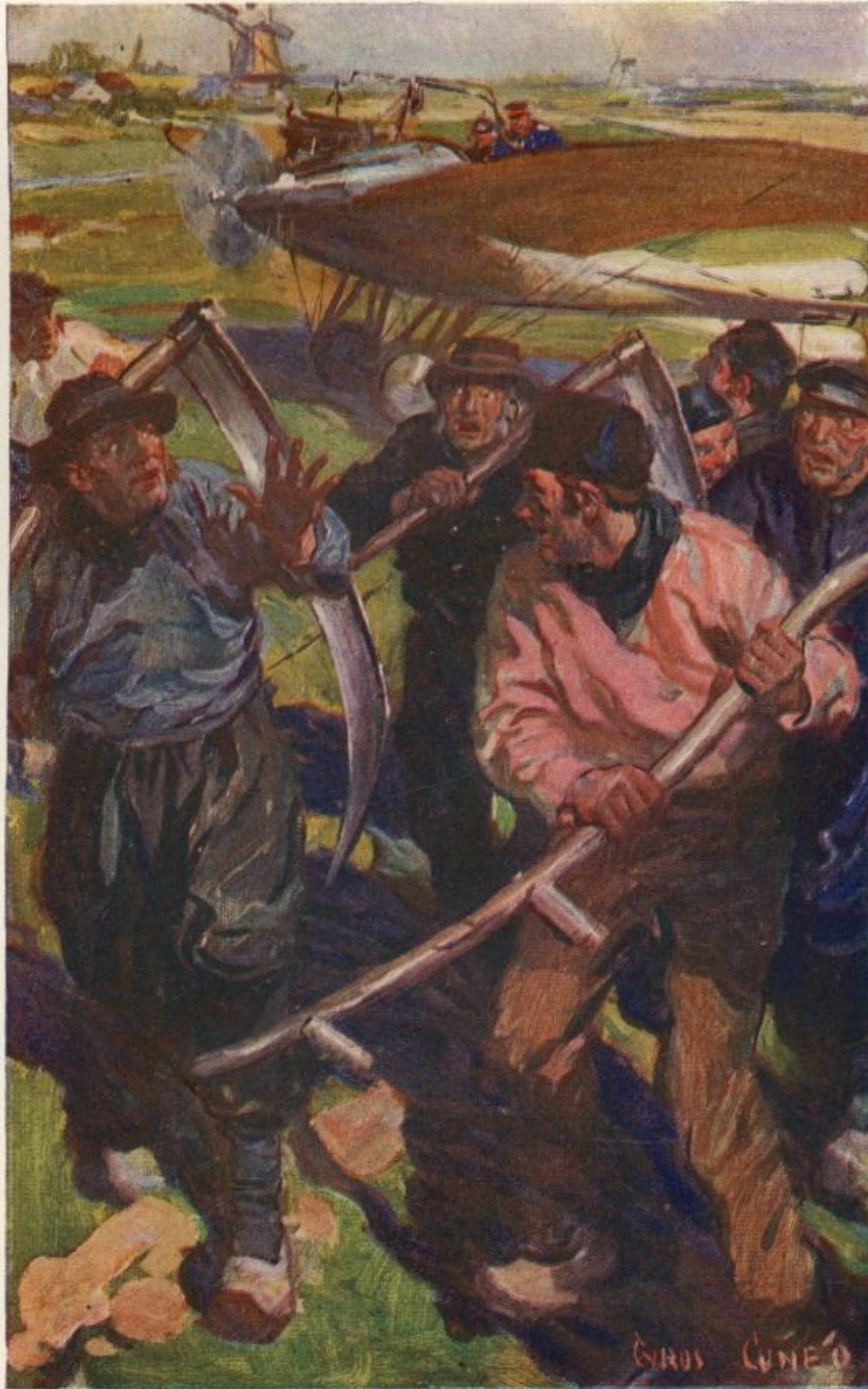
"THE PEASANTS SCATTERED OUT OF ITS PATH"