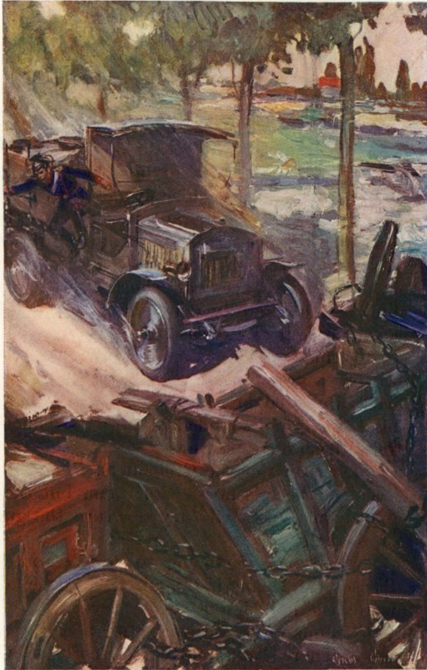
CLEARING THE ROAD

"Bravo!" shouted the two men waiting beside the motor-car.