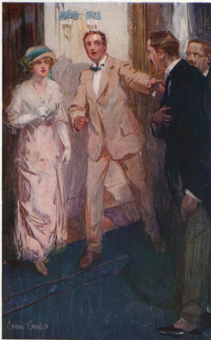
THE SPY UNMASKED