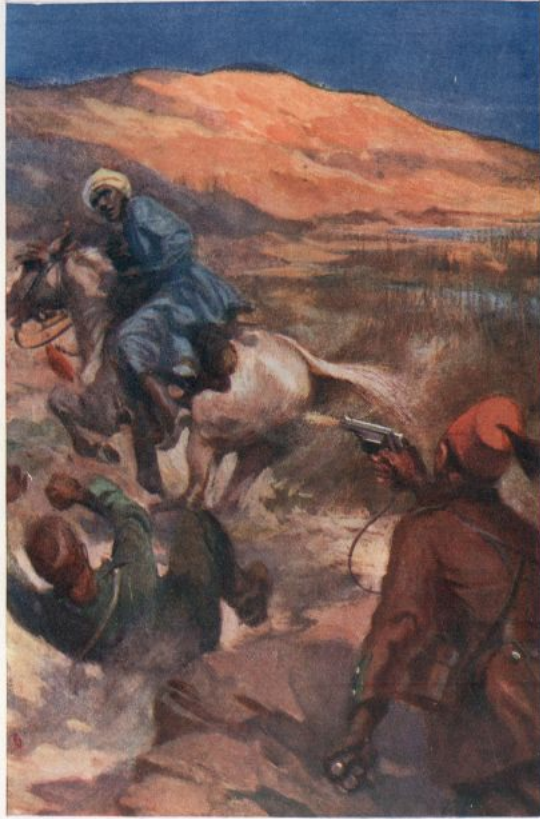
A DASH FOR LIBERTY