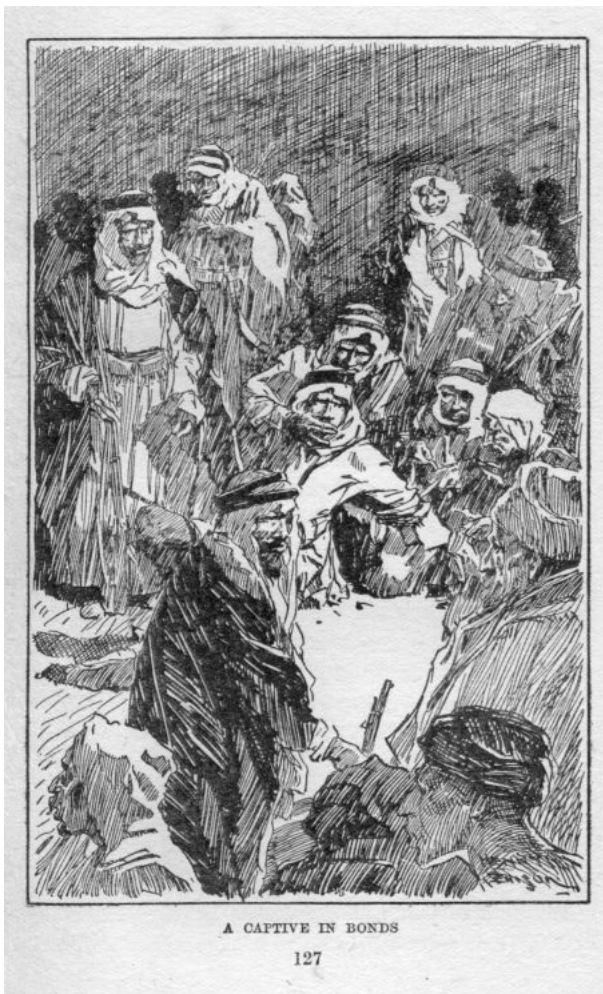
A CAPTIVE IN BONDS

In the dead of night he was suddenly startled into consciousness by a shrill whinny from his horse. He was in the act of springing to his feet when a number of forms closed in upon him silently out of the darkness. Before he could use his revolver he was seized, thrown violently back upon the ground, and in spite of his struggles securely held. It was so dark that he could not count his captors; but while he lay in their grasp there was the sound of others approaching; he heard no voices; the men who held him had said nothing, and one had pressed a hand upon his mouth. Presently a light was struck: Burnet remembered as an incongruous detail in such a spot that it was a safety match; and a small lantern was lit. By its feeble light he saw himself surrounded by a score of well-armed Arabs. He tried to speak, but the pressure upon his mouth did not relax. Two of the men swiftly tied his hands; another gagged him with a strip of dirty cloth cut from his garment; then he was lifted up, his horse was released, and the whole party, preceded by the man carrying the lantern, quitted the open space and started to march through the tall grasses below.