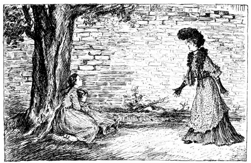
" 'Come here, Tom, and kiss your mother.' "

Lovey Mary waited until she was in the house, then she stole noiselessly around to the office window. The curtain blew out across her cheek, and the swaying lilacs seemed to be trying to count the china buttons on her back; but she stood there with staring eyes and parted lips, and held her breath to listen.