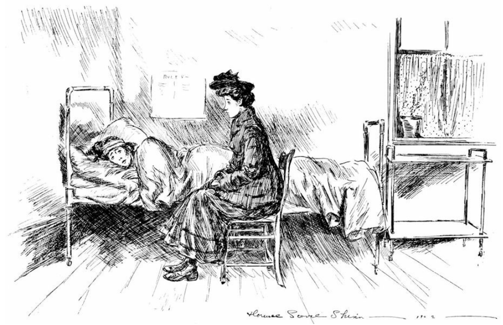
" 'Haven't you got any place you could go to?' "

Kate shook her head. "Nobody would be willing to look after me and nurse me. Lovey,"—she stretched her thin hand across to her entreatingly,—"take me home with you! I heard the doctor tell the nurse he couldn't do nothing more for me. I can't die here shut up with all these sick people. Take me wherever you are at. I'll try not to be no trouble, and—I want to keep straight."