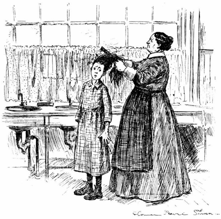
" 'Now the Lord meant you to be plain.' "

"Well, didn't he want me to have a mother and father?" burst forth Lovey Mary, indignantly, "or clothes, or money, or nothing? Can't I ever get nothing at all 'cause I wasn't started out with nothing?"