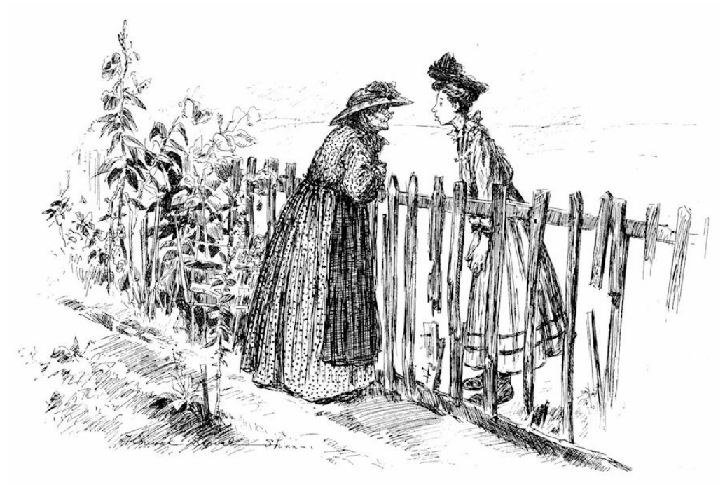
" 'Stick out yer tongue.' "

"This here is a denominational garden, an' I got every congregation I ever heared of planted in it. I ain't got no faverite bed. I keer fer 'emall jes alike. When you come to think of it, the same rule holds good in startin' a garden as does in startin' a church. You first got to steddy what sort of soil you goin' to work with, then you have to sum up all the things you have to fight ag'inst. Next you choose what flowers are goin' to hold the best places. That's a mighty important question in churches, too, ain't it? Then you got to plantin', the thicker the better, fer in both you got to allow fer a mighty fallin' off. After that you must take good keer of what you got, an' be sure to plant something new each year. Once in a while some of the old growths has to be thinned out, and the new upstarts an' suckers has to be pulled up. Now, if you'll come out here I'll show you round."