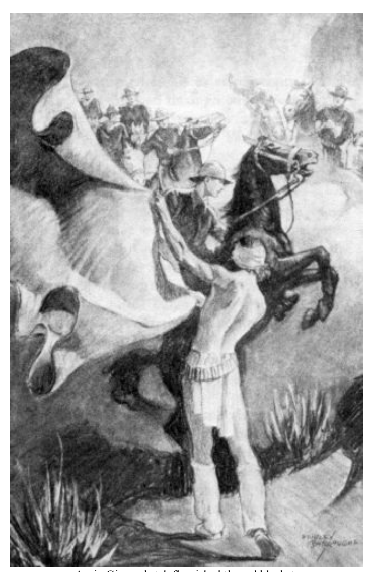
Again Gian-nah-tah flourished the red blanket.