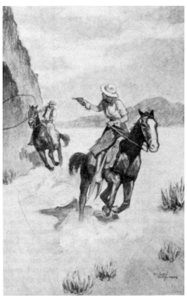
Standing in his stirrups, he swung his rope.