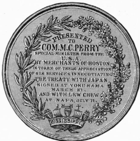
MEDAL PRESENTED BY THE MERCHANTS OF BOSTON.

form, on "The Enlargement of Geographical Science, a consequence to the opening of new avenues to commercial enterprise." The president of Columbia college, Charles King, in moving a vote of thanks, spoke in high praise of the merits and polished literary style of the essay. The prospects of trade, of coal, of mail-steamers to China, the new avenues open to American commercial enterprise, and the work of Christian missions heartily believed in by Perry, were discussed by him with clearness, strength and beauty.