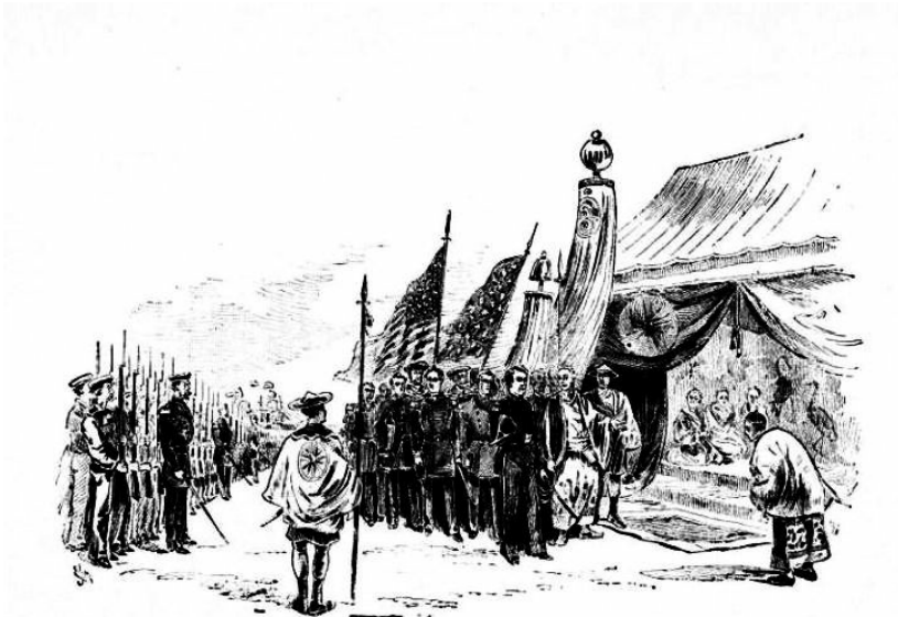
COMMODORE PERRY ENTERING THE TREATY-HOUSE.