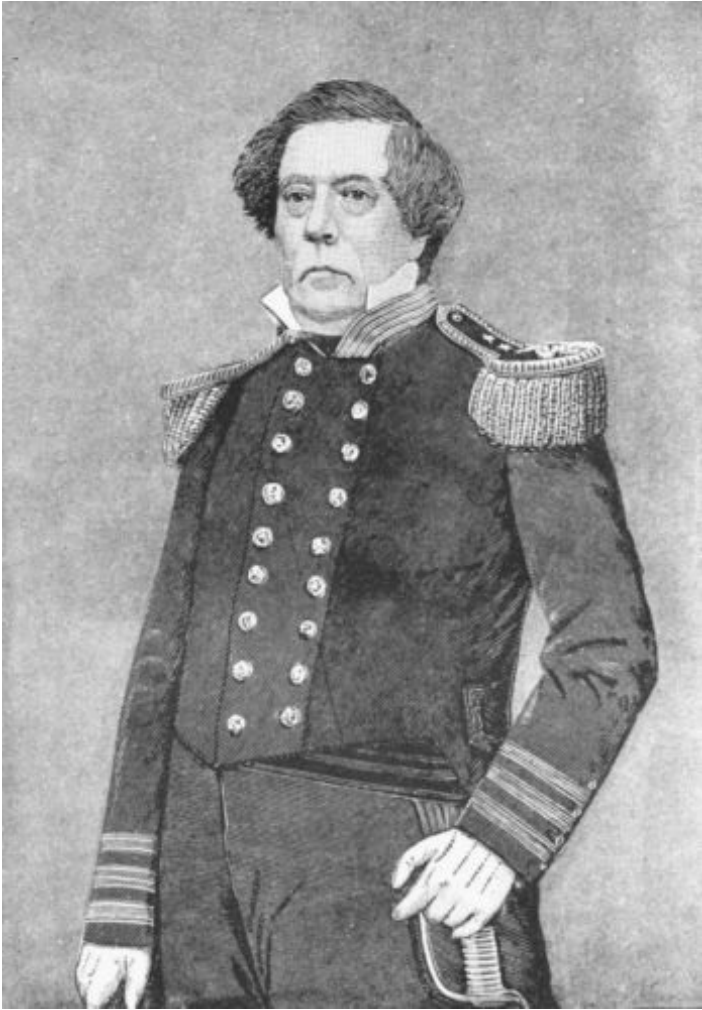
COMMODORE MATTHEW CALBRAITH PERRY.