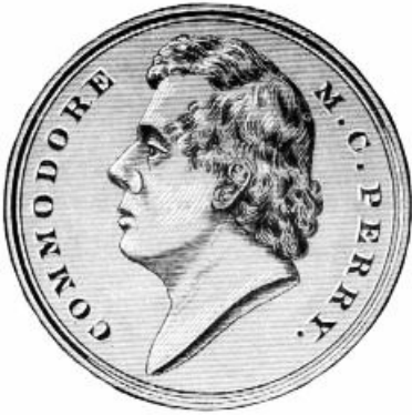
PERRY AT THE AGE OF FIFTY-FOUR.

charge of the guns, if the Commodore would land them on the beach. To this Perry said “no!” That “wherever the guns went, their officers and men must go with them.” Scott objected, declined the conditions, and renewed the bombardment with his small guns and mortars; but finding that he was only wasting time, he finally consented and asked Perry to send the guns with their naval crews. The marines were already in the trenches doing duty as part of the