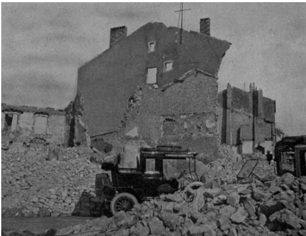
Street covered with stones from shelled buildings.

Our pass from the General Head-quarters carried us to Sainte Meneshould on the edge of the Argonne, where we had to apply to the Head-quarters of the division for a farther extension. The Staff are lodged in a house considerably the worse for German occupancy, where offices have been improvised by means of wooden hoardings, and where, sitting in a bare passage on a frayed damask sofa surmounted by theatrical posters and faced by a bed with a plum-coloured counterpane, we listened for a while to the jingle of telephones, the rat-tat of typewriters, the steady hum of dictation and the coming and going of hurried despatch-bearers and orderlies. The extension to the permit was presently delivered with the courteous request that we should push on to Verdun as fast as possible, as civilian motors were not wanted on the road that afternoon; and this request, coupled with the evident stir of activity at Head-quarters, gave us the impression that there must be a good deal happening beyond the low line of hills to the north. How much there was we were soon to know.