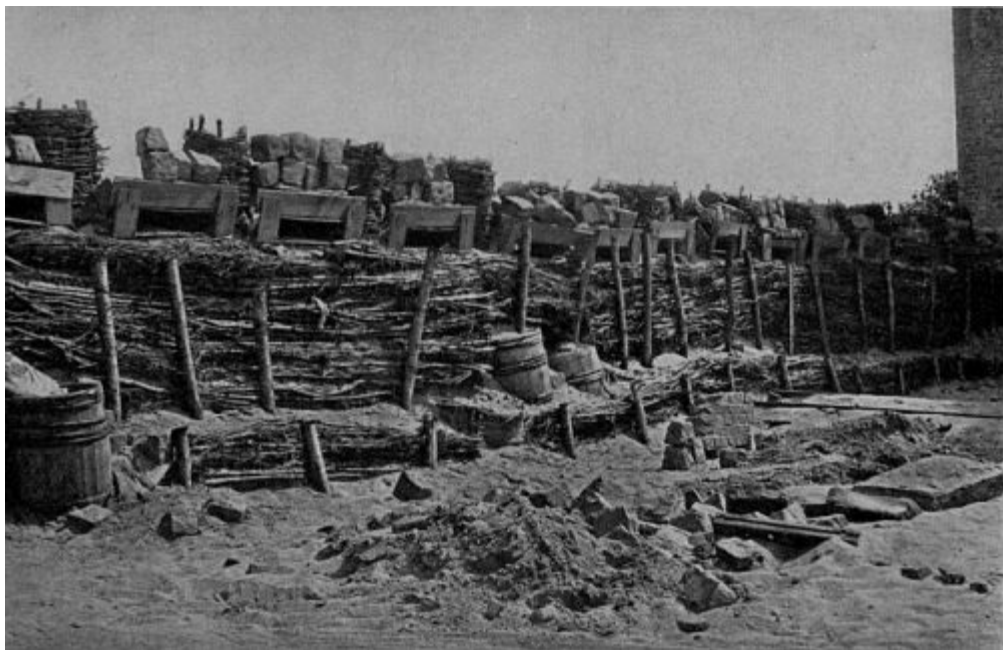
A typical trench in the dunes.

bugles playing. Every one of those men had a record of heroism, and every face in those ranks had looked on horrors unnameable. They had lost Dixmude—for a while—but they had gained great glory, and the inspiration of their epic resistance had come from the quiet officer who stood there, straight and grave, in his white gloves and gala uniform.