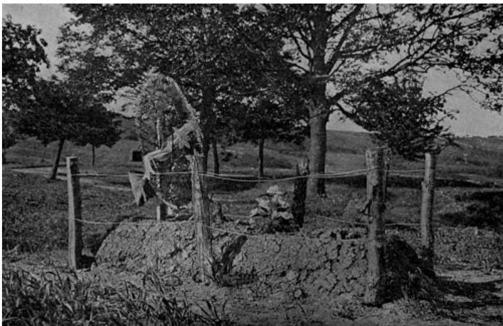
A war grave.

Up the hillside, in deeper shadow, was another little structure; a wooden shed with an open gable sheltering an altar with candles and flowers. Here mass is said by one of the conscript priests of the regiment, while his congregation kneel between the fir-trunks, giving life to the old metaphor of the cathedral-forest. Near by was the grave-yard, where day by day these quiet elderly men lay their comrades, the pères de famille who don't go back. The care of this woodland cemetery is left entirely to the soldiers, and they have spent treasures of piety on the inscriptions and decorations of the graves. Fresh flowers are brought up from the valleys to cover them, and when some favourite comrade goes, the men scorning ephemeral tributes, club together to buy a monstrous indestructible wreath with emblazoned streamers. It was near the end of the afternoon, and many soldiers were strolling along the paths between the graves. "It's their favourite walk at this hour," the Colonel said. He stopped to look down on a grave smothered in beady tokens, the grave of the last pal to fall. "He was mentioned in the Order of the Day," the Colonel explained; and the group of soldiers standing near looked at us proudly, as if sharing their comrade's honour, and wanting to be sure that we understood the reason of their pride. . .