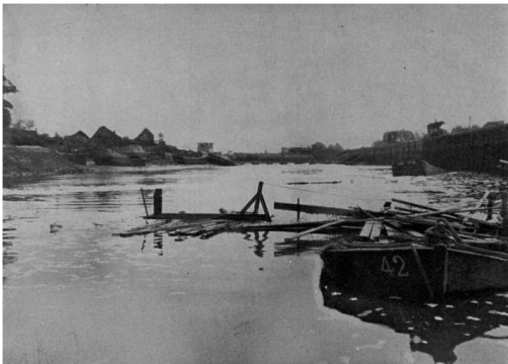
A pontoon bridge on the Yser.

The Englishness of things was emphasized, as we passed out through the suburbs, by the look of the crowd on the canal bridges and along the roads. Every nation has its own way of loitering, and there is nothing so unlike the French way as the English. Even if all these tall youths had not been in khaki, and the girls with them so pink and countrified, one would instantly have recognized the passive northern way of letting a holiday soak in instead of squeezing out its juices with feverish fingers.