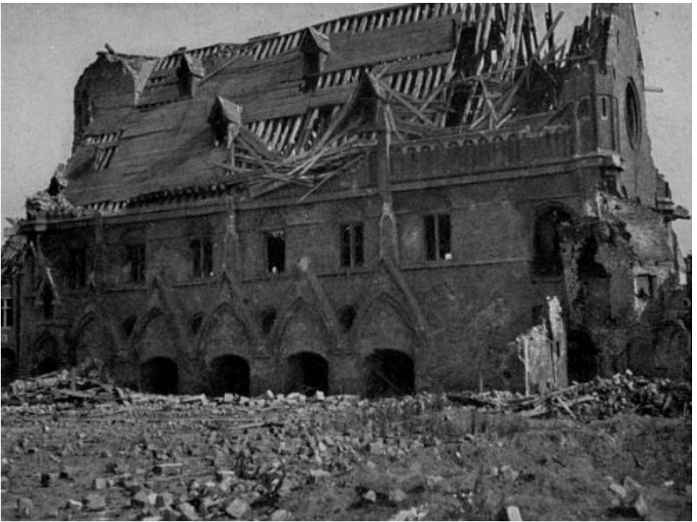
The Cloth Market at Nieuport.

Though not a house on the square was touched, the scene was one of unmitigated desolation. It was the first time we had seen the raw wounds of a bombardment, and the freshness of the havoc seemed to accentuate its cruelty. We wandered down the street behind the hotel to the graceful Gothic church of St. Eloi, of which one aisle had been shattered; then, turning another corner, we came on a poor bourgeois house that had had its whole front torn away. The squalid revelation of caved-in floors, smashed wardrobes, dangling bedsteads, heaped-up blankets, topsy-turvy chairs and stoves and wash-stands was far more painful than the sight of the wounded church. St. Eloi was draped in the dignity of martyrdom, but the poor little house reminded one of some shy humdrum person suddenly exposed in the glare of a great misfortune.