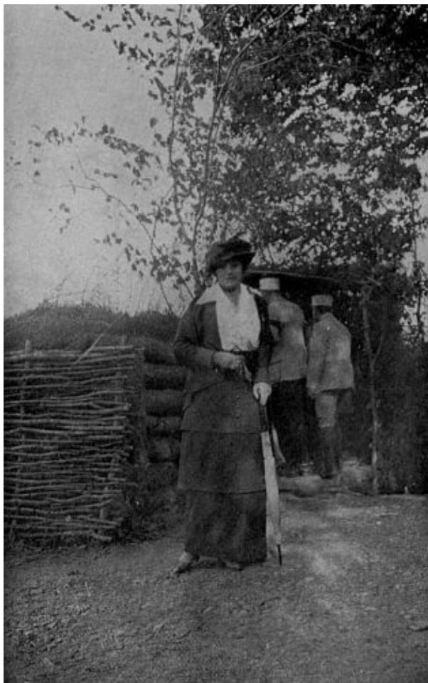
A French palisade.