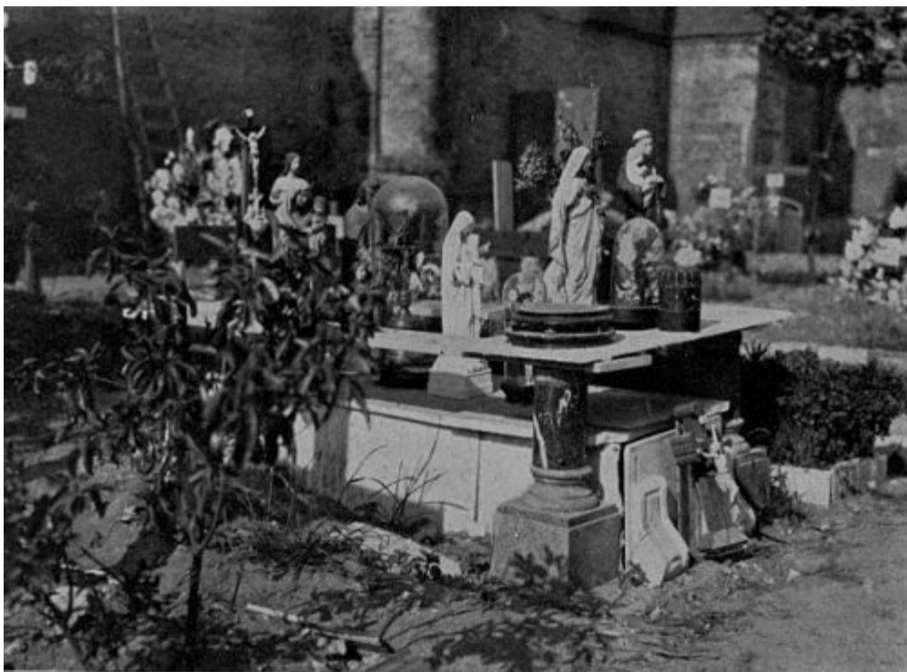
The colony of saints on a soldier's grave at Nieuport.

In front of the cathedral a German shell has dug a crater thirty feet across, overhung by splintered tree-trunks, burnt shrubs, vague mounds of rubbish; and a few steps beyond lies the peacefulest spot in Nieuport, the grave-yard where the zouaves have buried their comrades. The dead are laid in rows under the flank of the cathedral, and on their carefully set grave-stones have been placed collections of pious images gathered from the ruined houses. Some of the most privileged are guarded by colonies of plaster saints and Virgins that cover the whole slab; and over the handsomest Virgins and the most gaily coloured saints the soldiers have placed the glass bells that once protected the parlour clocks and wedding-wreaths in the same houses.