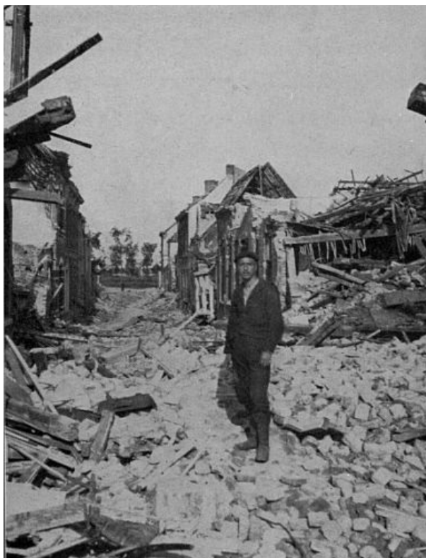
A street at Nieuport.

human spirit had begun to reassert itself. A handful of children were playing in the bottom of the crater, collecting “specimens” of glass and splintered brick; and about its rim the market-people, quietly and as a matter of course, were setting up their wooden stalls. In a few minutes the signs of German havoc would be hidden behind stacks of crockery and household utensils, and some of the pale women we had left in mournful contemplation of the ruins would be bargaining as sharply as ever for a sauce-pan or a butter-tub. Not once but a hundred times has the attitude of the average French civilian near the front reminded me of the gallant cry of Calanthea in