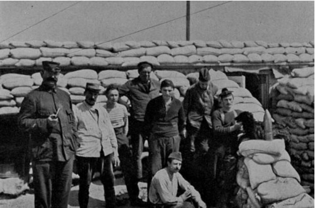
A sand-bag trench in the north.

It is like coming down from the mountains to leave the front. I never had the feeling more strongly than when we passed out of Belgium this afternoon. I had it most strongly as we drove by a cluster of villas standing apart in a sterile region of sea-grass and sand. In one of those villas for nearly a year, two hearts at the highest pitch of human constancy have held up a light to the world. It is impossible to pass that house without a sense of awe. Because of the light that comes from it, dead faiths have come to life, weak convictions have grown strong, fiery impulses have turned to long endurance, and long endurance has kept the fire of impulse. In the harbour of New York there is a pompous statue of a goddess with a torch, designated as "Liberty enlightening the World." It seems as though the title on her pedestal might well, for the time, be transferred to the lintel of that villa in the dunes.