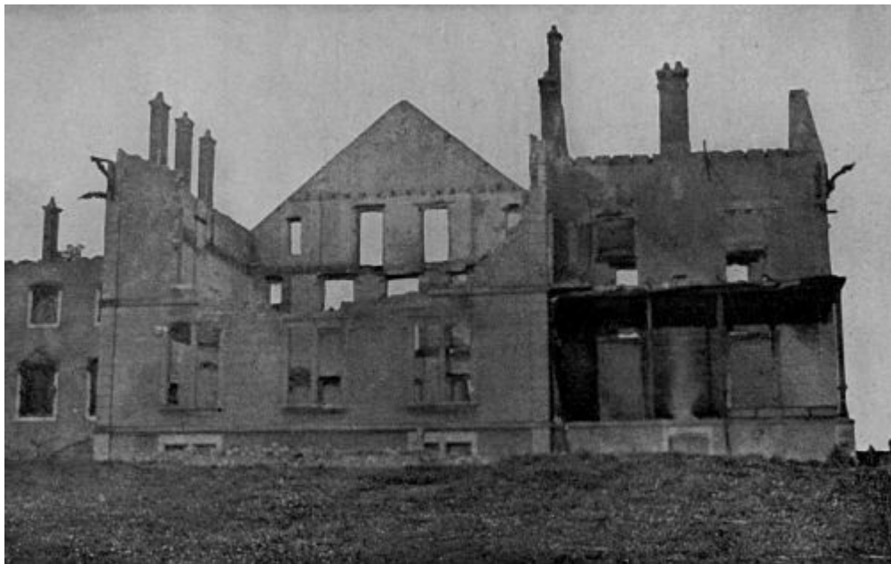
Ruins of General Lyautey's house in Crévic.

firs, and marked by the names and death-dates of the fallen. As he led us from one of these enclosures to another his face was lit with the flame of a gratified vocation. This particular man was made to do this particular thing: he is a born collector, classifier, and hero-worshipper. In the hall of the “presbytère” hangs a case of carefully-mounted butterflies, the result, no doubt, of an earlier passion for collecting. His “specimens” have changed, that is all: he has passed from butterflies to men, from the actual to the visionary Psyche.