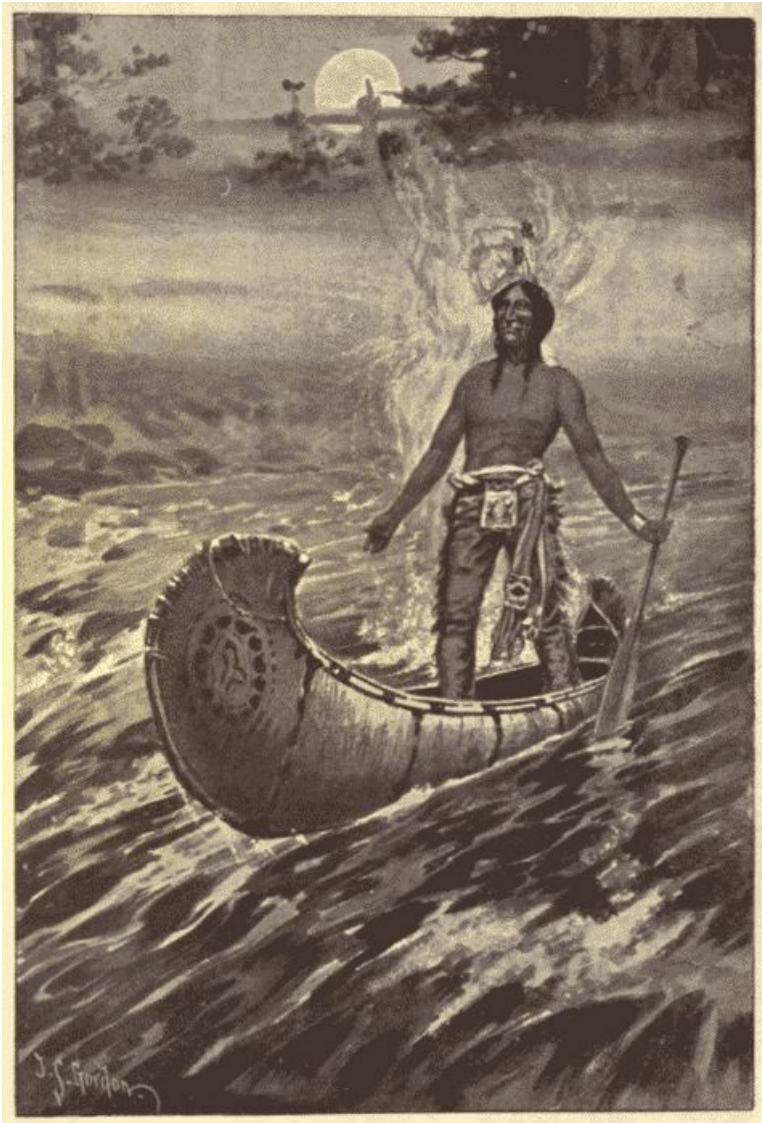
THE PASSING OF THE PROPHET.

crowded together, wood was brought in the midst, and Atotarho solemnly lit the fire. Then raising to the four quarters of the sky the rich silver-inlaid, brightly-feathered Calumet which the Arrowmaker had wrought for the alliance, he thanked the gods of the North, East, South and West, and presented it to the guests.