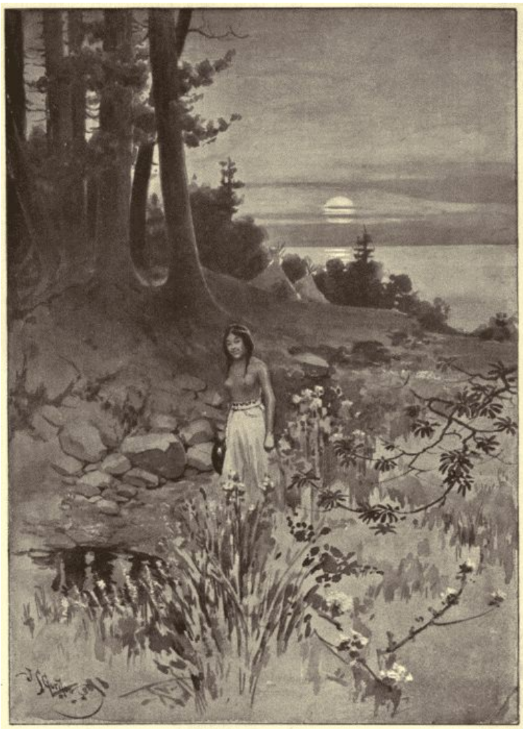
BESIDE THE SPRING.

The howl of wolves like devils in the distance broke upon his peace. They did not trouble him otherwise, for laying his hand upon his brow he threw himself on the ground under a spruce tree, and dropped into a deep slumber.