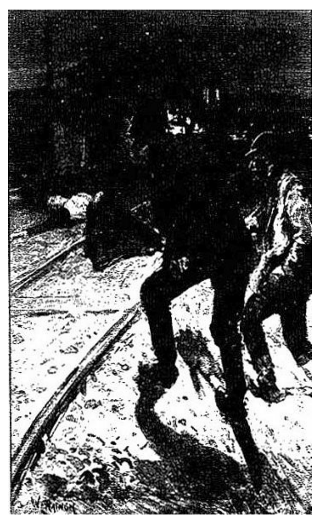
THE RESCUE-PARTY DISCOVER NELL ON THE RAILWAY TRACK