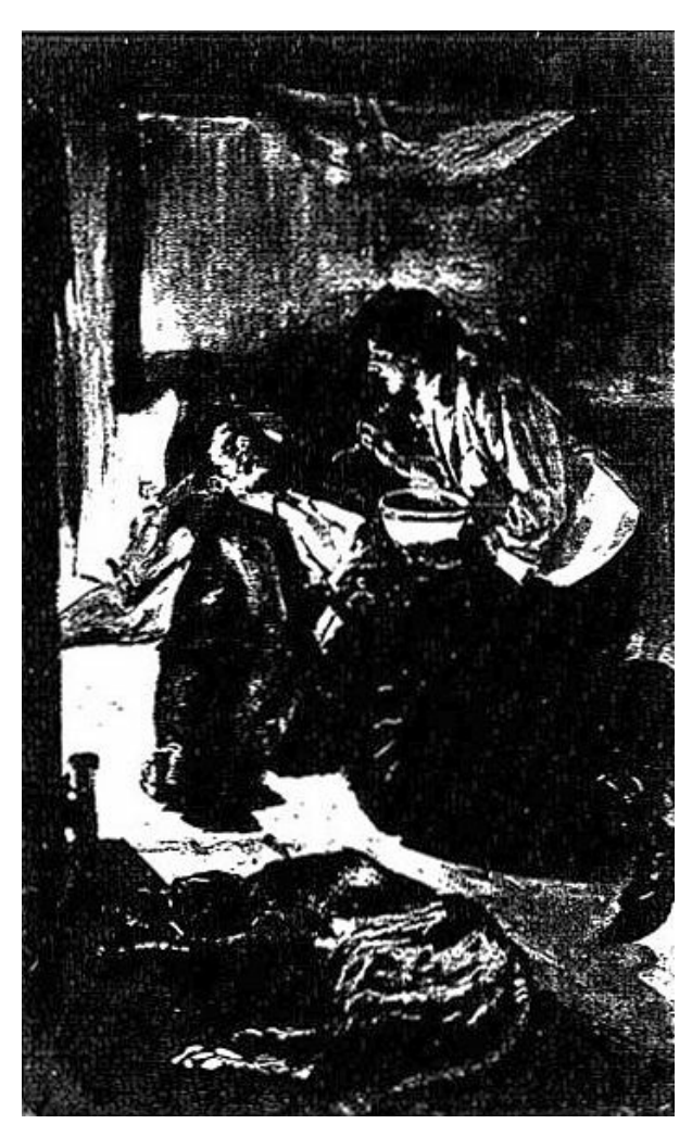
NELL NURSES THE STRANGER