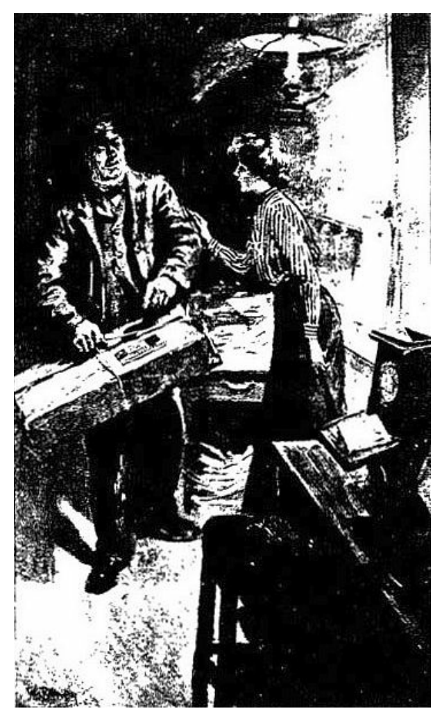
"FOR ME? BUT I DON'T EXPECT ANY PARCEL!"