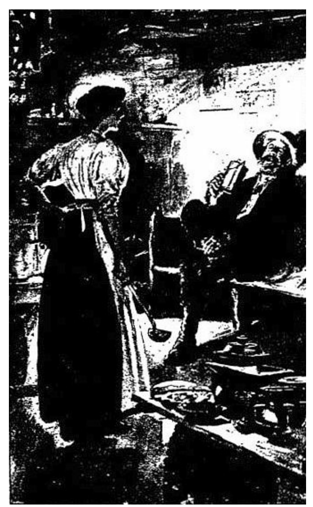
"I HEARD A LITTLE ABOUT A FRIEND OF YOURS AWAY DOWN IN THE CITY," HE SAID.