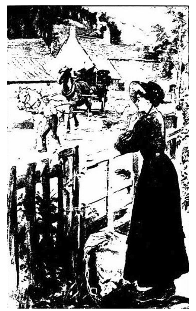
"COME RIGHT IN, WILL YOU, PLEASE, MISS?"