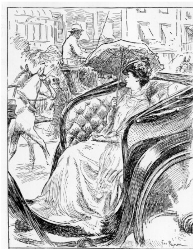
"SHE WAS THE ONLY BEAUTIFUL WOMAN WHO SAT ALONE AND COMPANIONLESS"