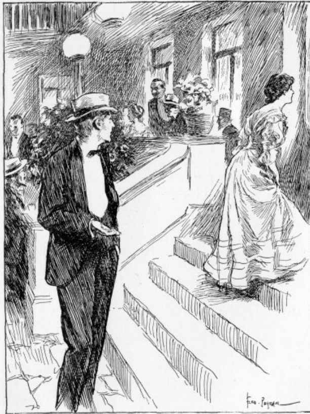
"SHE WAS ALREADY ON HER WAY UP THE GREY STONE STEPS"