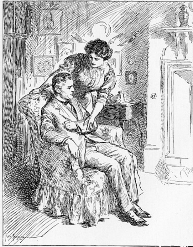
" SHE LEANED OVER HIM, ONE HAND ON THE BACK OF HIS CHAIR "

him to look at her as other men looked at her. Who was he that he should set himself on a pedestal? Perhaps he had grown shy from the rust of his country life, the slow drifting apart from the world of men and women. Perhaps—she rose swiftly to her feet and crossed the room.