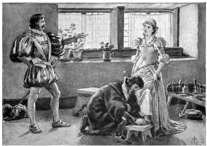
"HE SAW HER EYES BRIGHTER THAN THE STARS."

who is to have this wonderful prize. They have a higher place to sit than the rest of the meadow, and the common people of the town, who do not pretend to be poets at all, can stand wherever they can find room. The goldsmith and his daughter have the highest seats of all, and the shoemaker is next to them, for he is supposed to know a good song when he hears it. All the other masters have good places too, including the town clerk. The knight is somewhere in the crowd of people who know nothing about poetry.