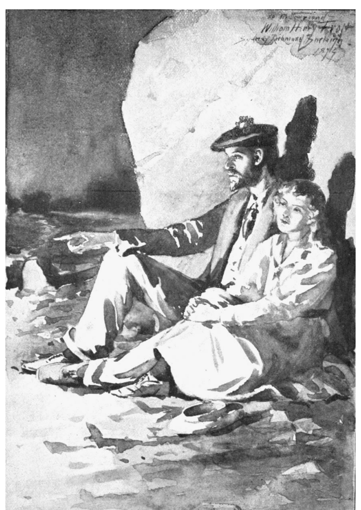
"AT LAST WE CAN SEE SOMETHING IN THE FIRE"