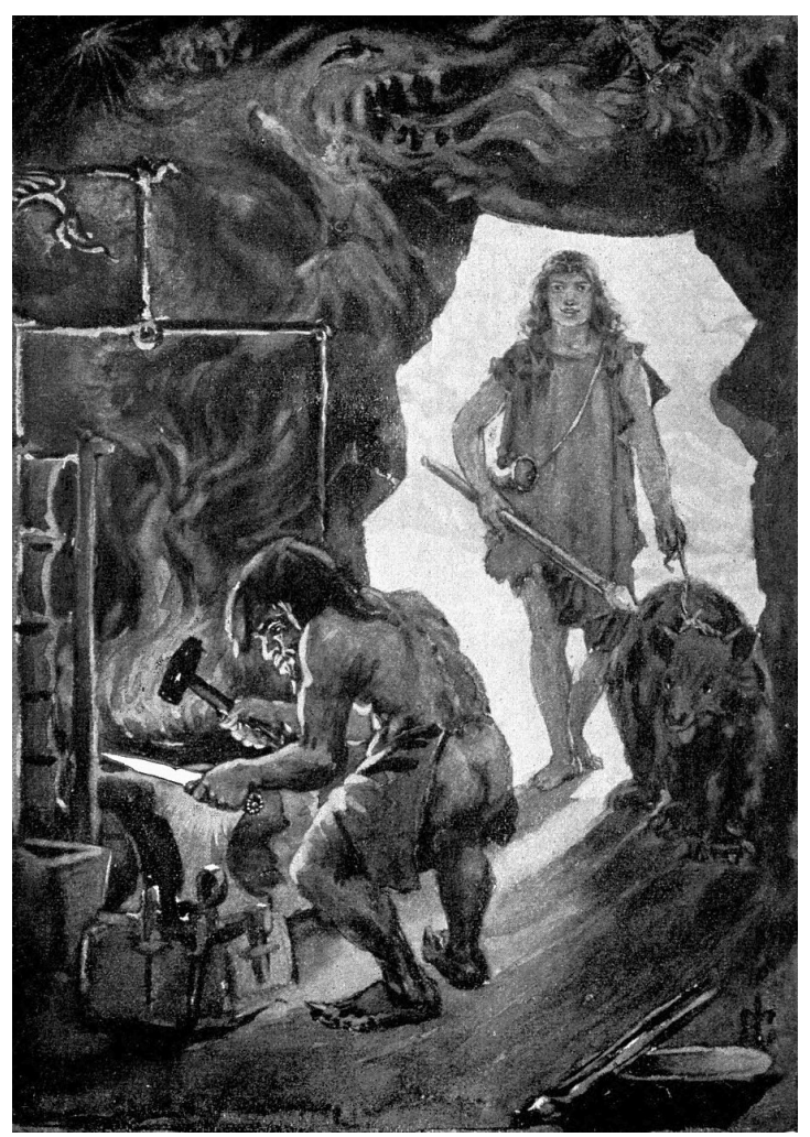
"THE SUNLIGHT FOLLOWS HIM STRAIGHT INTO THE CAVE."