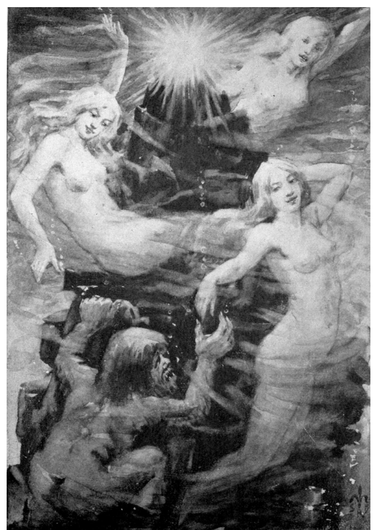
"THE GOLD SHINES OUT SO BRIGHT AND BEAUTIFUL."