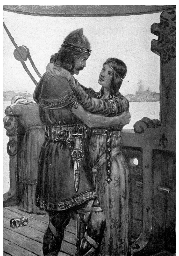
"AS IF THEY COULD NEVER GAZE ENOUGH."