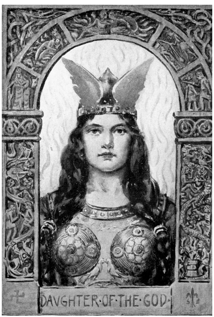
DAUGHTER OF THE GOD