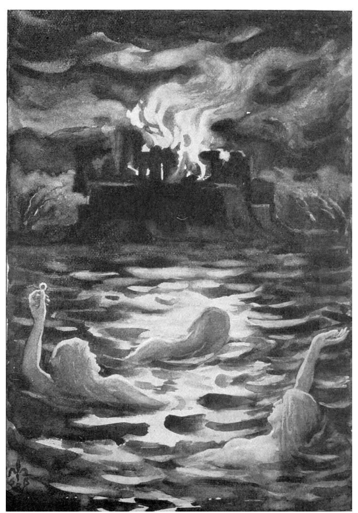
"THEIR TREASURE IS THEIR OWN AGAIN."