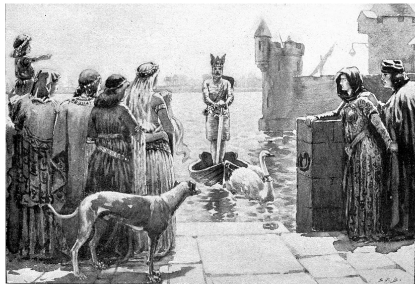
"THE KNIGHT OF HER DREAM."

knight must return to the temple of the Holy Grail. Now, seven days ago a bell in the temple rang, all of itself, meaning that help was needed somewhere. One of the knights put on his armor and called for his horse, and stood ready, but he knew not where he was to go or what he was to do, till a swan drawing a little boat came sailing along upon the river, and the knight said: 'Take back the horse; I will go with the swan,' and so here is he come to see what help is wanted of him