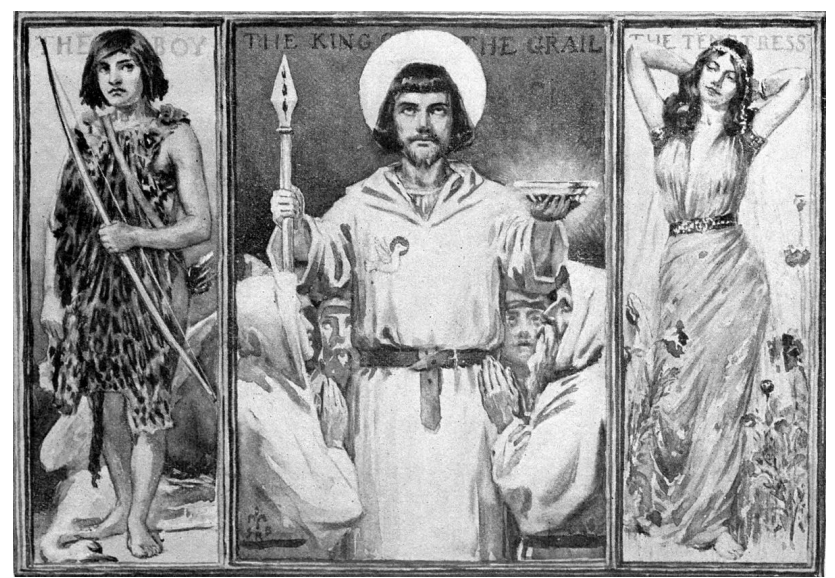
THE BOY THE KING OF THE GRAIL THE TEMPTRESS

"They all draw back from him in dread at his look and his words—all but one. For the Fool goes straight to him and touches the wound with the spear. Instantly the wound is healed. 'You shall uncover the Grail no more,' he says, 'for I am chosen to be its King instead of you.' He makes a sign to the boys who have brought it, and they uncover it and place it in his hand. He holds it above his head and again the red blood in it glows and throbs. Down from the dome flies a white dove and rests above it. Before it, and before him who holds it, kneel the old King, no longer king now, the old knight, and the woman, for her too this new King has saved, for he has come, the best knight of the world and one whom she could not tempt. The simple Fool is the King of the Grail. The sound of the singing voices comes down from the dome, and from far above them come still the voices of the bells. Surely to any who could know how to hear it their chiming must say again: 'Taught by pity—him I have chosen.'"