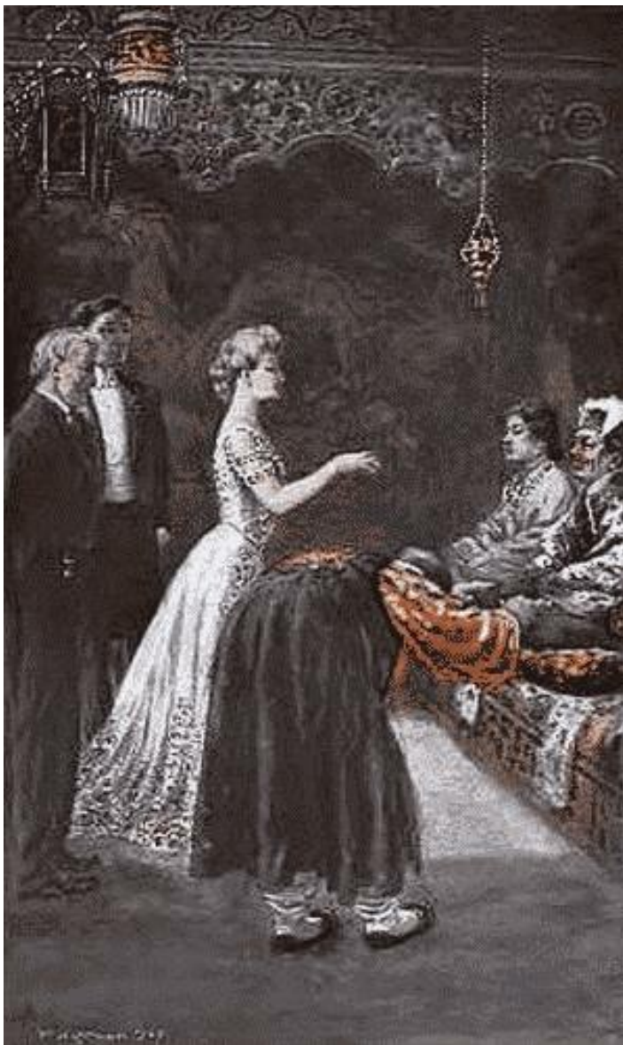
"The twinkling eyes of the Emperor fixed themselves on Miss Hemster."