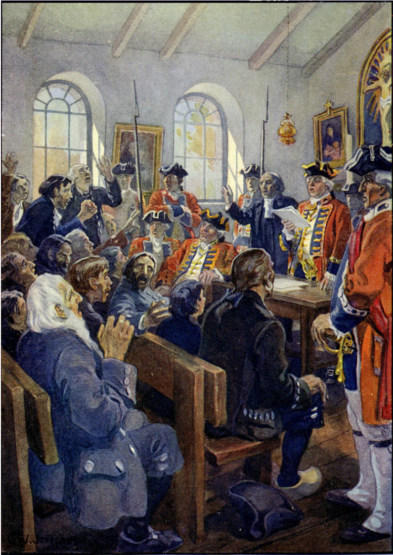
IN THE PARISH CHURCH AT GRAND PRÉ, 1755 From a colour drawing by C. W. Jefferys