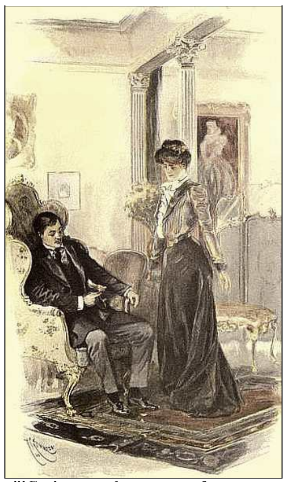
"'Can't you make any sort of an excuse for yourself, Sidney?' she demanded"

"How did you happen to do it, Sidney?" she asked quietly, as she seated herself again beside the deserted tea table and began absently setting the disordered cups into straight rows.