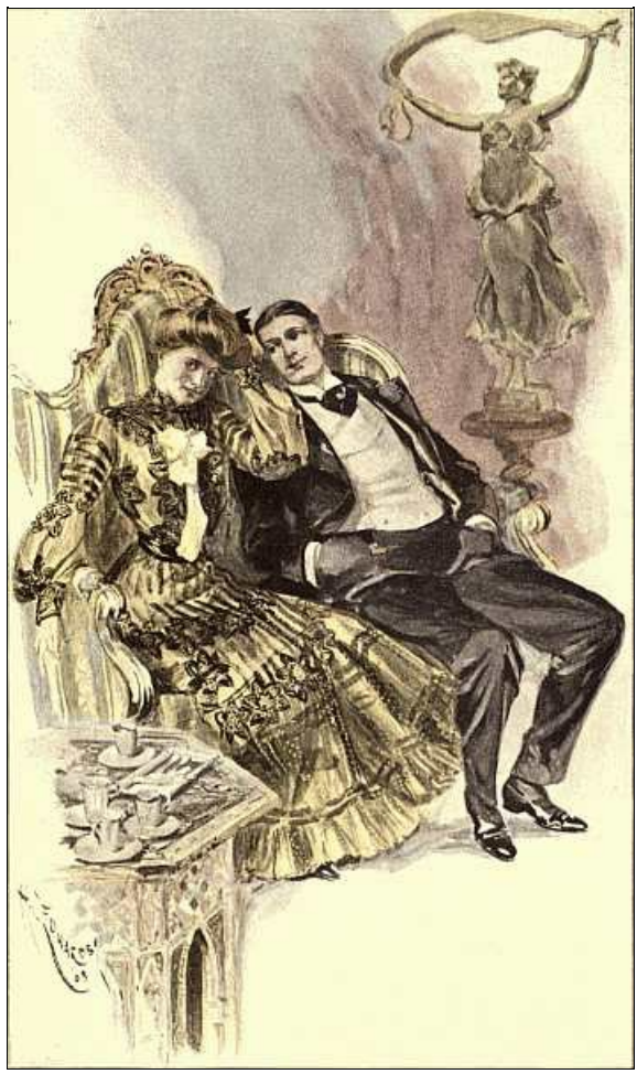
"'I believe I might as well ask you now'"

"I say, Sally," he remarked at length, apparently apropos of nothing in particular; "how does it happen that you have never married me?"