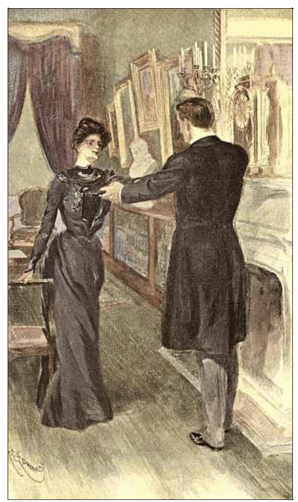
"'Beatrix?' he said"