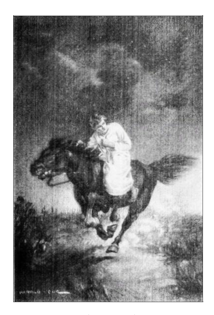
They couldn't shoot him—he was going too fast