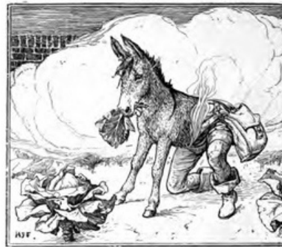
The hunter is transformed into a donkey

long ears, and he saw with horror that he had changed into a donkey. But as he was still very hungry and this juicy salad tasted very good to his present nature, he went on eating with a still greater appetite. At last he got hold of another kind of cabbage, but scarcely had swallowed it when he felt another change, and he once more regained his human form.