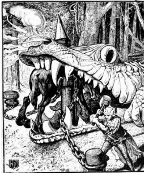
The youth secures the dragon

interpret the secret signs engraved upon the ring, but it took him seven weeks to make them out clearly. Then he gave the youth the following instructions how to overcome the Dragon of the North: 'You must have an iron horse cast, which must have little wheels under each foot. You must also be armed with a spear two fathoms long, which you will be able to wield by means of the magic ring upon your left thumb. The spear must be as thick in the middle as a large tree, and both its ends must be sharp. In the middle of the spear you must have two strong chains ten fathoms in length. As soon as the Dragon has made himself fast to the spear, which you must thrust through his jaws, you must spring quickly from the iron horse and fasten the ends of the chains firmly to the ground with iron stakes, so that he cannot get away from them. After two or three days the monster's strength will be so far exhausted that you will be able to come near him. Then you can put Solomon's ring upon your left thumb and give him the finishing stroke, but keep the ring on your third finger until you have come close to him, so that the monster cannot see you, else he might strike you dead with his long tail. But when all is done, take care you do not lose the ring, and that no one takes it from you by cunning.'