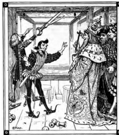
The Emperor comes to see his new clothes

'Yes,' said all the knights, but they could see nothing, for there was nothing there.