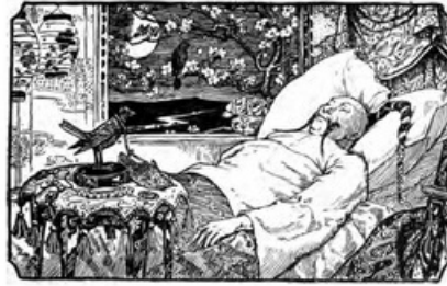
The true Nightingale sings to the Emperor

'You have done that already!' said the Nightingale. 'I brought tears to your eyes the first time I sang. I shall never forget that. They are jewels that rejoice a singer's heart. But now sleep and get strong again; I will sing you a lullaby.' And the Emperor fell into a deep, calm sleep as she sang.