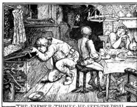
—THE FARMER THINKS HE SEES THE DEVIL— ·IN THE CHEST·

Little Klaus gave the farmer his sack with the dry skin, and got instead a good bushelful of money. The farmer also gave him a wheelbarrow to carry away his money and the chest. 'Farewell,' said Little Klaus; and away he went with his money and the big chest, wherein sat the sexton.