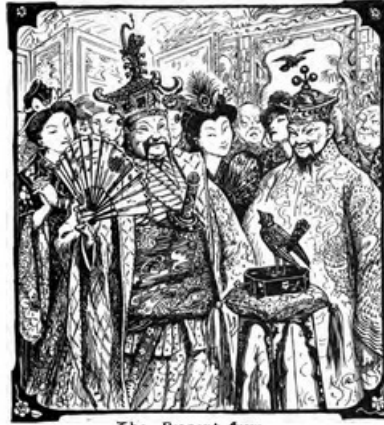
The Present from the Emperor of Japan

little kitchenmaid was allowed to stand behind the door, now that she was a Court-cook. Everyone was dressed in his best, and everyone was looking towards the little grey bird to whom the Emperor nodded.