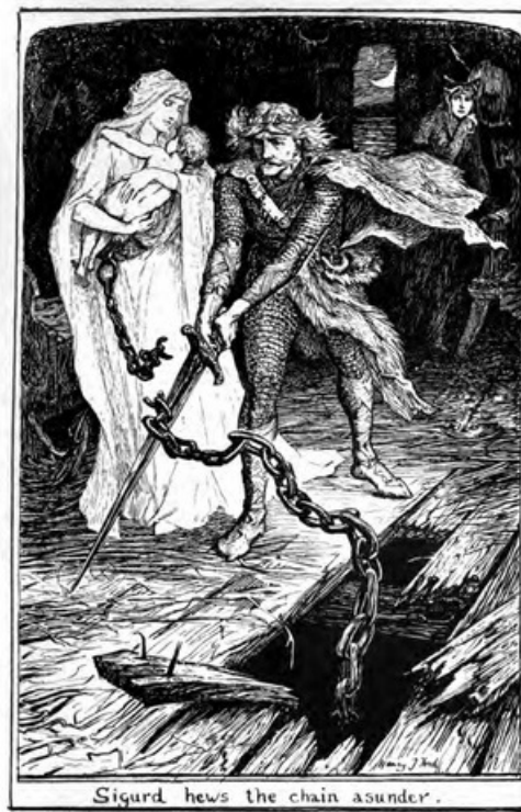
Sigurd hews the chain asunder.

Next evening the same thing happened again, just as before, but as the woman was going away she said in a sad tone, 'Two are gone, and one only is left,' and then disappeared as before. The nurse was still more frightened when she heard the woman say this, and thought that perhaps some danger was hanging over the child, though she had no ill-opinion of the unknown woman, who, indeed, had behaved towards the child as if it were her own. The most mysterious thing was the woman saying 'and only one is left,' but the nurse guessed that this must mean that only one day was left, since she had come for two days already.