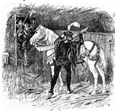
Prince Saphir steals the horse and harness

the gate of the castle, which was even more splendid than he had expected, for it was built of crystal, and all its ornaments were of massive gold. However, he had no thoughts to spare for its beauty, and quickly buried his grain of sand in the earth. In one instant the gates flew open, and all the dwellers inside fell sound asleep. Saphir flew straight to the stable, and already had his hand on the finest horse it contained, when his eye was caught by a suit of magnificent harness hanging up close by. It occurred to him directly that the harness belonged to the horse, and without ever thinking of harm (for indeed he who steals a horse can hardly be blamed for taking his saddle), he hastily placed it on the animal's back. Suddenly the people in the castle became broad awake, and rushed to the stable. They flung themselves on the Prince, seized him, and dragged him before their lord; but, luckily for the Prince, who could only find very lame excuses for his conduct, the lord of the castle took a fancy to his face, and let him depart without further questions.