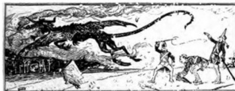
The Fiend defeated

Then the Dragon flew away with a loud shriek, and had no more power over them. But the three soldiers took the little whip, whipped as much money as they wanted, and lived happily to their lives' end.