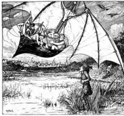
The comrades in the flying ship meet the drinker

And so the mighty drinker was added to the company; and the ship flew farther, and even farther, till again the Simpleton looked out, and this time he saw a man dragging a bundle of wood, walking through the forest beneath them.