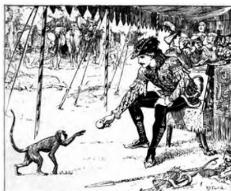
The King makes friends with the Green Monkey

Prince Alphege. Indeed, had the King her son not been deservedly beloved a revolution would certainly have arisen.