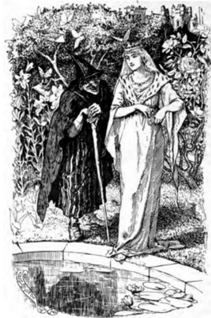
The witch persuades the Queen to bathe

'Why are you sad and cast down, fair Queen? You should not mope all day in your rooms, but should come out into the green garden, and hear the birds sing with joy among the trees, and see the butterflies fluttering above the flowers, and hear the bees and insects hum, and watch the sunbeams chase the dew-drops through the rose-leaves and in the lily-cups. All the brightness outside would help to drive away your cares, O Queen.'