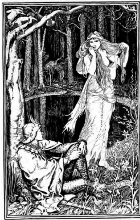
THE WITCH-MAIDEN SEES THE YOUNG MAN UNDER A TREE

The youth hesitated for a little, but presently he heard the birds saying from the top of the tree, 'Go where she calls you, but take care to give no blood, or you will sell your soul.' So the youth went with her, and soon they reached a beautiful garden, where stood a splendid house, which glittered in the moonlight as if it was all built out of gold and silver. When the youth entered he found many splendid chambers, each one finer than the last. Hundreds of tapers burnt upon golden candlesticks, and shed a light like the brightest day. At length they reached a chamber where a table was spread with the most costly dishes. At the table were placed two chairs, one of silver, the other of gold. The maiden seated herself upon the golden chair, and offered the silver one to her companion. They were served by maidens dressed in white, whose feet made no sound as they moved about, and not a word was spoken during the meal. Afterwards the youth and the Witch-maiden conversed pleasantly together, until a woman, dressed in red, came in to remind them that it was bedtime. The youth was now shown into another room, containing a silken bed with down cushions, where he slept delightfully, yet he seemed to hear a voice near his bed which repeated to him, 'Remember to give no blood!'