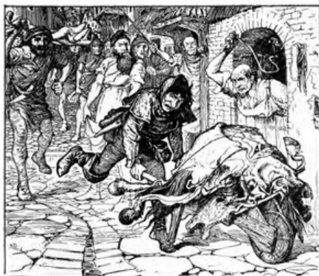
The shoemakers and tanners drive Big Klaus out of the town

'Aha!' said he when he came home, 'Little Klaus shall pay dearly for this. I will kill him!'