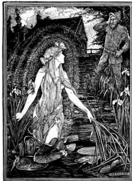
The miller sees the nixy of the mill pond

The poor miller was much horrified by these tidings, and went in to his wife with a heavy heart to tell her and his relations of the fatal bargain he had just struck with the nixy. 'I would gladly give up all the good fortune she promised me,' he said, 'if I could only save my child.' But no one could think of any advice to give him, beyond taking care that the child never went near the mill-pond.