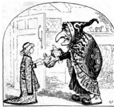
LAGREE gives the 2 bottles to FAIRERTHANAFairy.

Several years passed, during which time the Princess grew accustomed to her lonely life, obeyed the Fairy's orders, and by degrees forgot all about the court of the King her father.