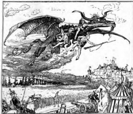
The Dragon carries off the three soldiers

He gave them a little whip, saying, 'Whip and slash with this, and as much money as you want will jump up before you. You can then live as great lords, keep horses, and drive about in carriages. But after seven years you are mine.' Then he put a book before them, which he made all three of them sign. 'I will then give you a riddle,' he said; 'if you guess it, you shall be free and out of my power.' The dragon then flew away, and they journeyed on with their little whip. They had as much money as they wanted, wore grand clothes, and made their way into the world. Wherever they went they lived in merrymaking and splendour, drove about with horses and carriages, ate and drank, but did nothing wrong.