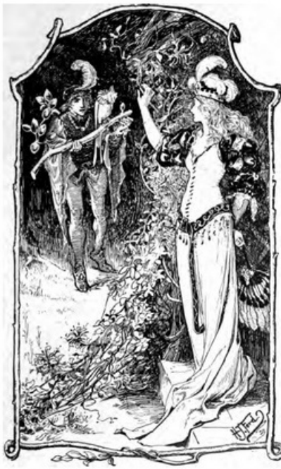
'STANDING IN THE DOORWAY A CHARMING MAIDEN AT WHOSE SIGHT HIS MIND SEEMED TO GIVE WAY'

Then they all fell into each other's arms, till the fairy mounted her chariot, placed Aglantine by her side, and Saphir and Serpentine on the front seat. She also sent a message to the Prince's attendants that they might travel slowly back to the Court of King Peridor, and that the beautiful bird had really been found. This matter being comfortably arranged, she started off her chariot. But in spite of the swiftness with which they flew through the air, the time passed even quicker for Saphir and Serpentine, who had so much to think about.