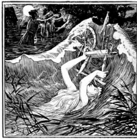
‘A wave swept the spinning-wheel from the bank’

The hunter determined to become a shepherd, and his wife too became a shepherdess. So they herded their sheep for many years in solitude and sadness.