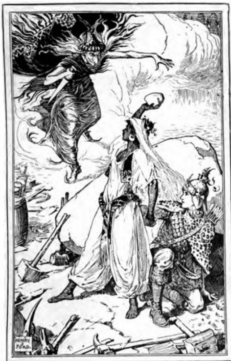
THE BLACK GIRL STOPS THE WITCH WITH A BIT OF THE ROCK

But this time the Fairy had watched the Prince's movements from her window, and she saw him hiding himself behind the rock with her daughter. She uttered a piercing shriek so that the mountains re-echoed with the sound of it, and the terrified pair had hardly dared to look out from their hiding-place when the enraged woman, with her dress and hair flying in the wind, hurried over the bridge of clouds. The Prince at once gave himself up for lost, but the girl told him to be of good courage and to follow her as quickly as he could. But before they left their shelter she broke off a little bit of the rock, spoke some magic words over it, and threw it in the direction her mother was coming from. In a moment a glittering palace arose before the eyes of the Fairy which blinded her with its dazzling splendour, and with its many doors and passages prevented her for some time from finding her way out of it.