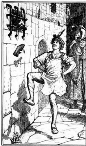
'He was skipping along so merrily'

In the morning the King and the Queen saw plainly where their daughter had been, and they took the Soldier and put him into prison.