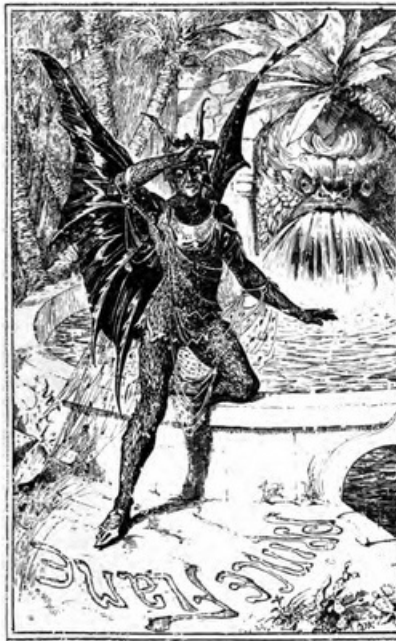
PRINCE GNOME LEARNS THE NAME OF HIS RIVAL AT THE GOLDEN FOUNTAIN

But, alas! the joy of liberty lasted but a short time. The Princess, having wandered in vain up and down the forest, stopped at last on the edge of a fountain. As she walked she wrote on the trees: 'If ever the Prince, my lover, comes this way, let him know that it is here I dwell, and that I sit daily on the edge of this fountain, mingling my tears with its waters.'