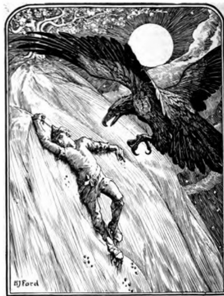
The boy attacked by the eagle on the Glass Mountain

It was almost pitch dark now, and only the stars lit up the Glass Mountain. The poor boy still clung on as if glued to the glass by his blood-stained hands. He made no struggle to get higher, for all his strength had left him, and seeing no hope he calmly awaited death. Then all of a sudden he fell into a deep sleep, and forgetful of his dangerous position, he slumbered sweetly. But all the same, although he slept, he had stuck his sharp claws so firmly into the glass that he was quite safe not to fall.