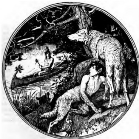
'My brother, my brother, I am becoming a wolf!'

But he would not listen, and, making no reply, he took his bow and arrows and left the hut. The snows fell and melted, yet he never returned; and at last the heart of the girl grew cold and hard, and her little boy became a burden in her eyes, till one day she spoke thus to him: 'See, there is food for many days to come. Stay here within the shelter of the hut. I go to seek our brother, and when I have found him I shall return hither.'