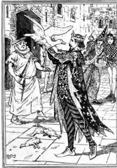
The King catches the White Duck

And now before my eyes you're slain. I gave you always of the best; I kept you warm in my soft nest. I loved and watched you day and night— You were my joy, my one delight.'