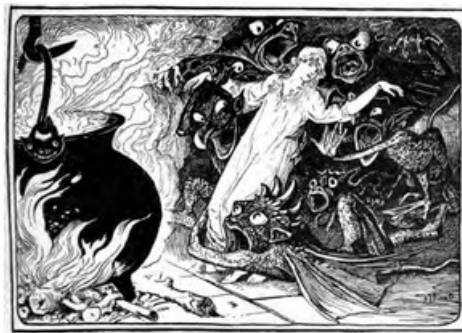
The evil spirits drag the girl to the cauldron

At the same moment the crow appeared and hopped all round the room with joy. It thanked the Princess most heartily for her goodness, and said that its sufferings had already been greatly lessened.