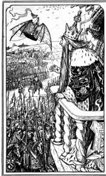
SIMPLETON'S ARMY APPEARS BEFORE THE KING

In the meantime the courtier, who had run all the way from the palace, reached the ship panting and breathless, and delivered the King's message.