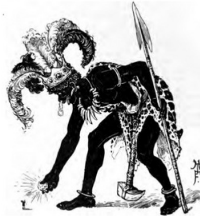
The Black King's Gift .

northern flight, he untied the silk cord from his stork's wings, and away they went, getting nearer home every minute. At length the Hazel-nut child came to his native village; then he undid the ribbon from the stork's neck and the diamond fell to the ground; he covered it first with sand and stones, and then ran to get his parents, so that they might carry the treasure home, for he himself was not able to lift the great diamond.