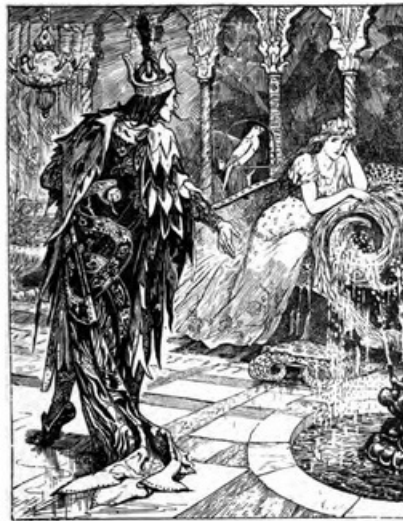
The Wizard King pays a visit to the Princess

When he saw her well-disposed towards him, he exclaimed: 'Madam, I have a most important secret to confide to you, and I beg you not to be alarmed by what I am about to say. I am here on behalf of the Queen your mother, with the object of delivering your Highness; to prove which, behold this portrait which she gave me herself.' So saying he drew forth the miniature from under his wing. The Princess's surprise was great, but after what she had seen and heard it was impossible not to indulge in hope, for she had recognised the likeness of herself which her mother always wore.