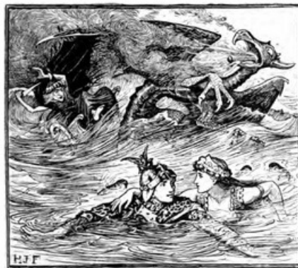
'But the waters seized her chariot and sunk it in the lowest depths'

While he was gazing on it and wondering what it could mean, he heard the sweeping of wings above him, and looking up he saw a huge vulture with open claws swooping down upon him. In a moment he seized the egg and flung it at the bird with all his might, and lo and behold! instead of the ugly monster the most beautiful girl he had ever seen stood before the astonished eyes of the Prince.