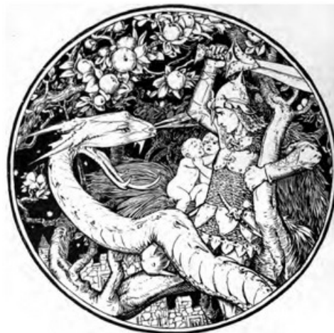
'Then the youth swung his mighty sword in the air, and with one blow cut off the serpent's head'

For a long time he wandered sadly all through the beautiful underworld, and one day he met a magician who asked him the cause of his tears. The youth told him all that had befallen him, and the magician said: