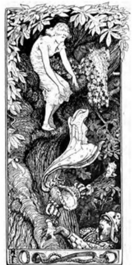
And then her dress'

When she was led to the stake, she laid the shirts on her arm, and as she stood on the pile and the fire was about to be lighted, she looked around her and saw six swans flying through the air. Then she knew that her release was at hand and her heart danced for joy. The swans fluttered round her, and hovered low so that she could throw the shirts over them. When they had touched them the swan-skins fell off, and her brothers stood before her living, well and beautiful. Only the youngest had a swan's wing instead of his left arm. They embraced and kissed each other, and the Queen went to the King, who was standing by in great astonishment, and began to speak to him, saying, 'Dearest husband, now I can speak and tell you openly that I am innocent and have been falsely accused.'