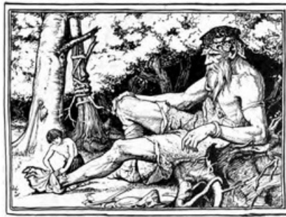
The Herd-boy binds up the Giant's foot.