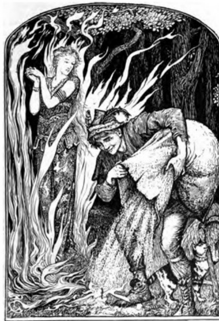
Martin extinguishes the flames

Together they entered the palace, and were received by the King with great kindness. Turning to his daughter, he said: