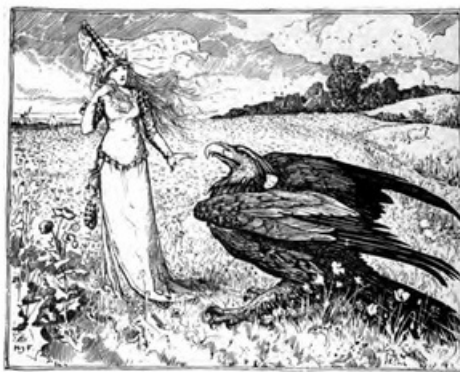
The Princess and the eagle in the flowery meadow

'If you speak truth, my lord,' replied the Princess, 'restore to me the liberty you have deprived me of. Otherwise I can only look on you as my worst enemy.'