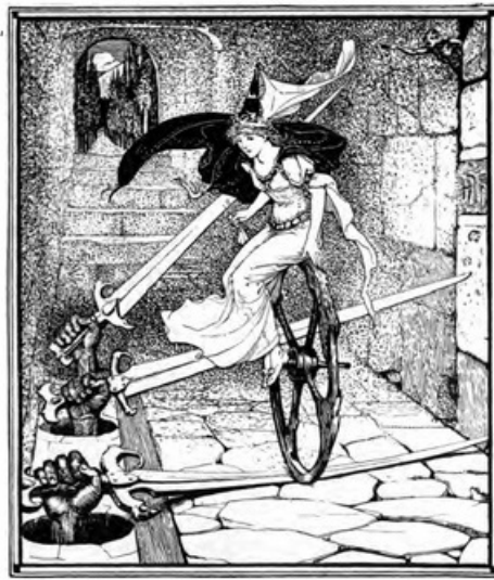
'Then she reached the three cutting swords, and got on her plough-wheel and rolled over them'

In the evening, when she had washed up and was ready, she felt in her pocket and found the three nuts which the old toad had given her. She cracked one and was going to eat the kernel, when behold! there was a beautiful royal dress inside it! When the bride heard of this, she came and begged for the dress, and wanted to buy it, saying that it was not a dress for a serving-maid. Then she said she would not sell it unless she was granted one favour—namely, to sleep by the Prince's door. The bride granted her this, because the dress was so beautiful and she had so few like it. When it was evening she said to her bridegroom, 'That stupid maid wants to sleep by your door.'