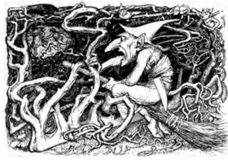
The comb grows into a forest

So the witch saw there was no help to be got from her old servants, and that the best thing she could do was to mount on her broom and set off in pursuit of the children. And as the children ran they heard the sound of the broom sweeping the ground close behind them, so instantly they threw the handkerchief down over their shoulder, and in a moment a deep, broad river flowed behind them.