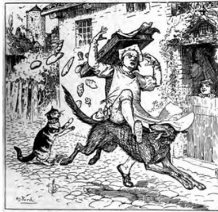
Schurka upsets the baker

Fancy bread of every kind. Come and buy, come and take, Sure you'll find it to your mind.'